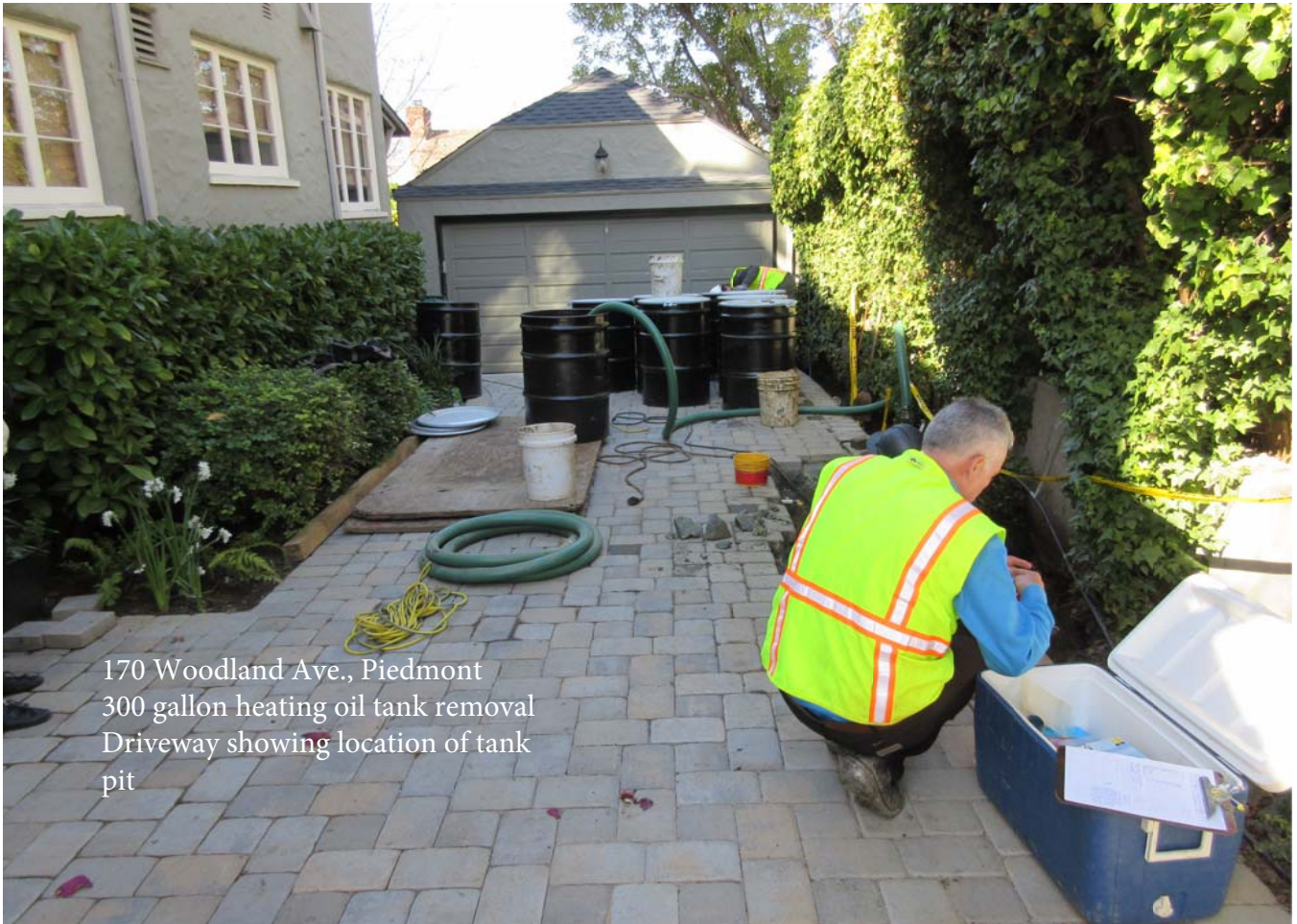
170 Woodland Ave., Piedmont 300 gallon heating oil tank removal Driveway showing location of tank pit