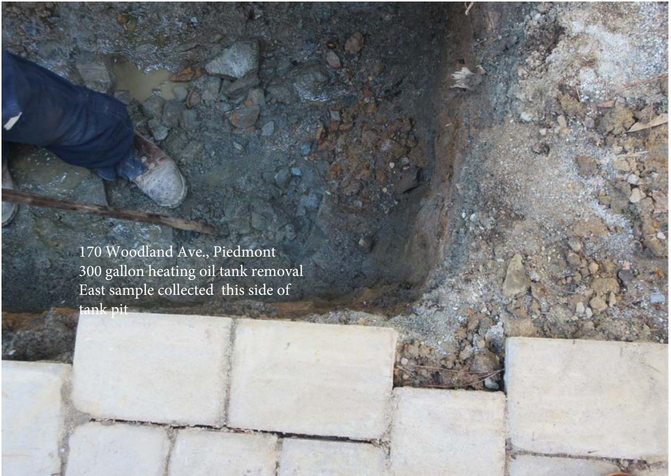
170 Woodland Ave., Piedmont 300 gallon heating oil tank removal East sample collected this side of tank pit