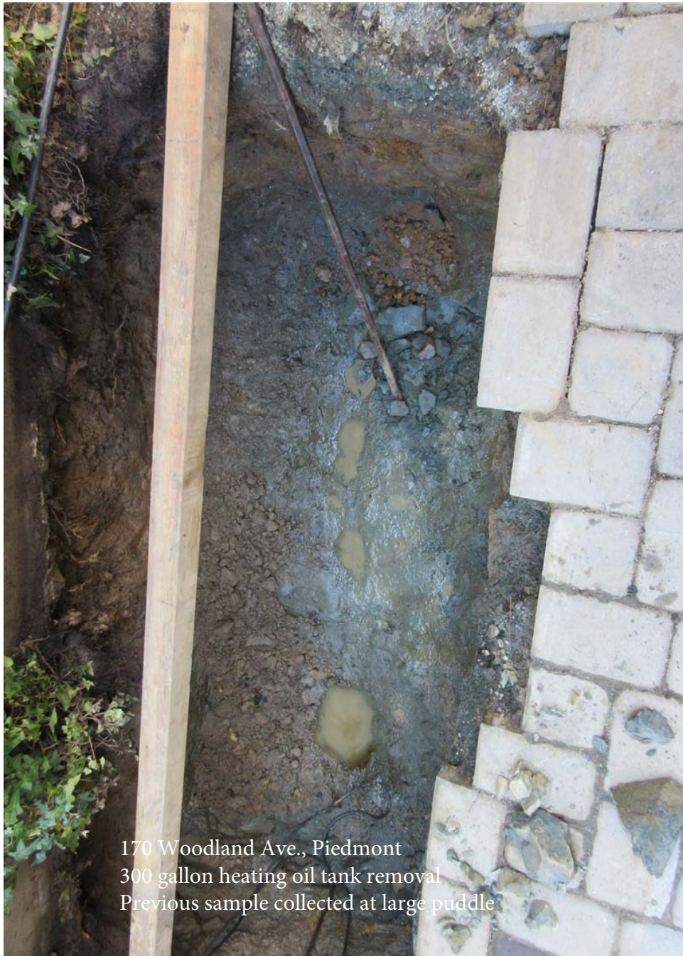
170 Woodland Ave., Piedmont 300 gallon heating oil tank removal Previous sample collected at large puddle