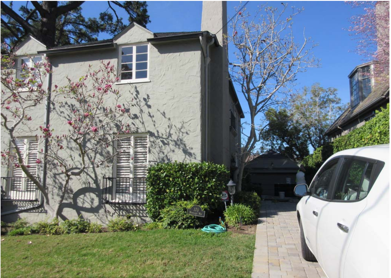
170 Woodland Ave., Piedmont 300 gallon heating oil tank removal