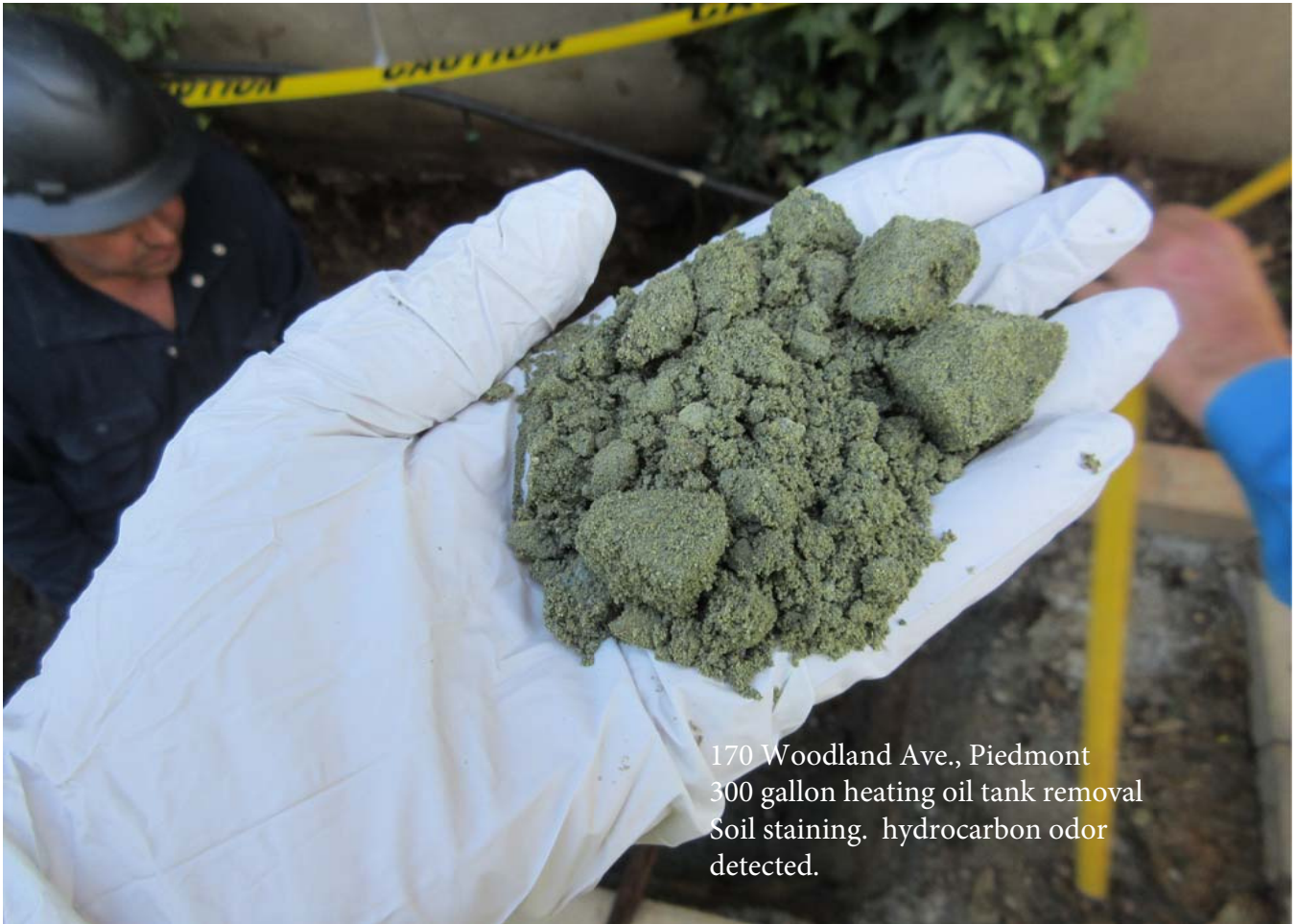
170 Woodland Ave., Piedmont 300 gallon heating oil tank removal Soil staining. hydrocarbon odor detected.