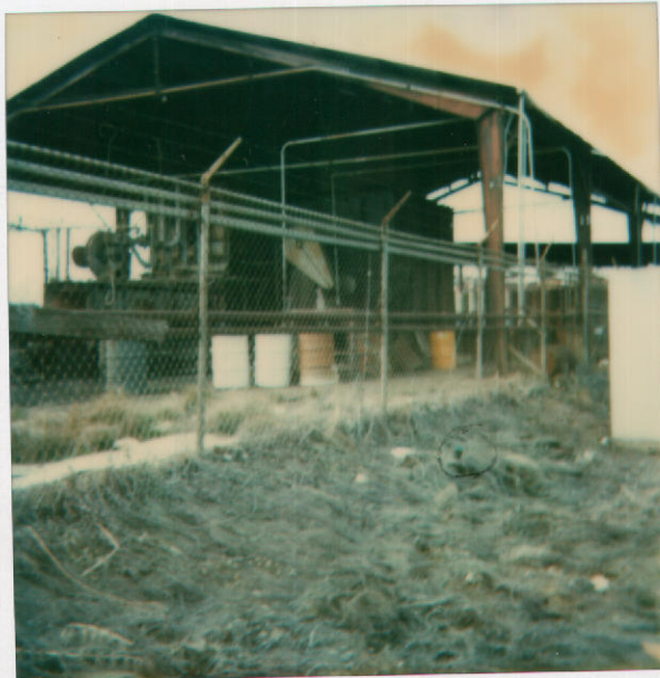
EJM 012688-3 dead vegetation area near RR tracks