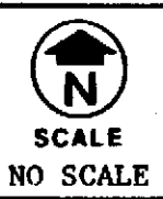
FIGURE 1. EARTH METRICS INCORPORATED SAMPLING LOCATIONS ON THE NIELSEN SITE