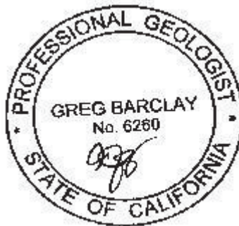
Greg Barclay PG 6260