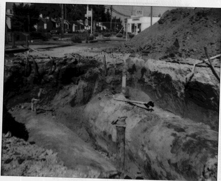
790 Bockman Rd, San Lorenzo 6-19-92 PE

NNW N NNE NW NE WNW PHOTO ENE W TAKEN E WSW LOOKING... ESE SW SE SSW S SSE