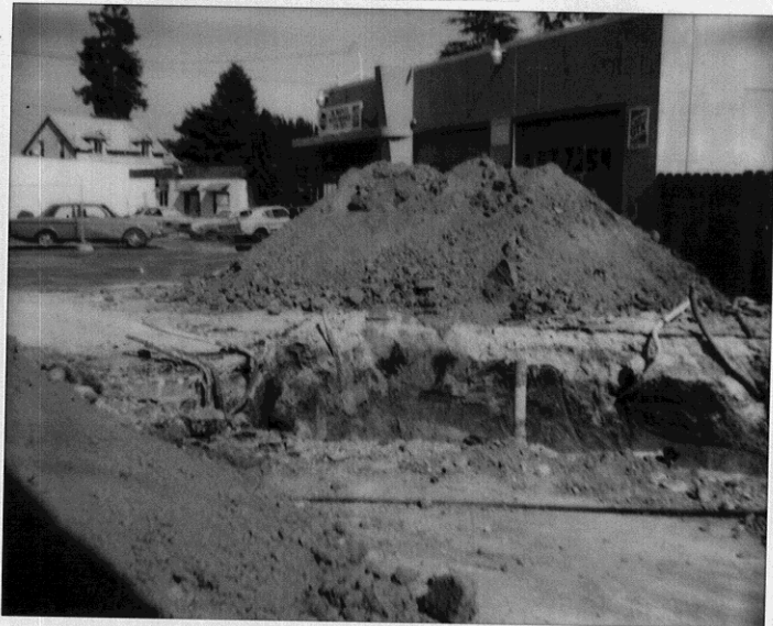
790 Bockman Rd San Lorenzo 6-19-92

SITE NAME: Al Maples Honda Repair SITE ADDRESS: 790 Bockman Rd PHOTOGRAPHER: Pam Evans AFFILIATION: HAZMAT DIV DATE OF PHOTO: 6-19-92 PROGRAM: Underground Tank