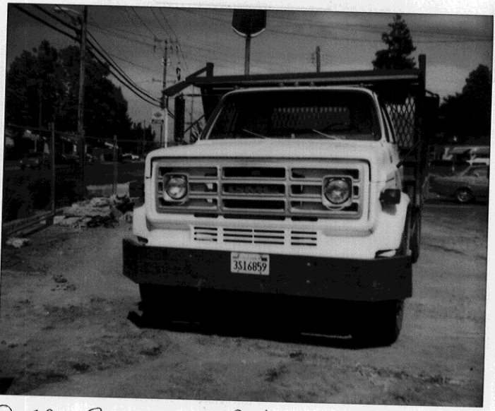
@ 790 Bockman Rd San Lorenzo 6-22-92 PE

Description: additional water dirt was removed from tank pit as of 6-22-92.