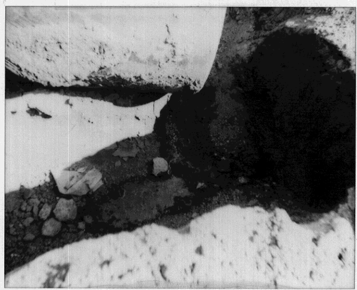
790 Bockman Rd, San Lorenzo, North end of North tank pit 6-26-92 PE

NNW N NNE NW NE WNW PHOTO ENE W TAKEN E WSW LOOKING... ESE SW SE (SSW) S SSE