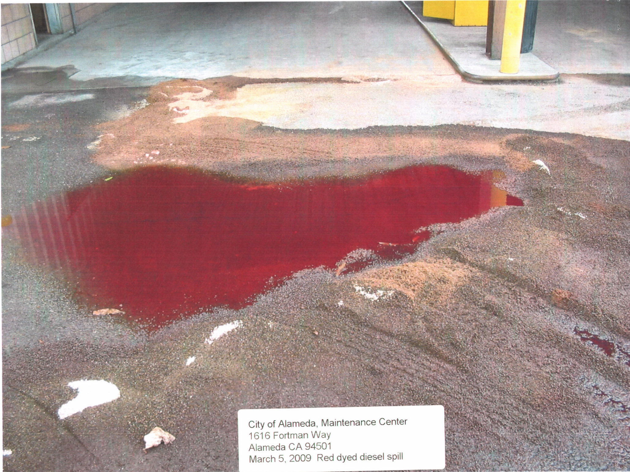
City of Alameda, Maintenance Center 1616 Fortman Way Alameda CA 94501 March 5, 2009 Red dyed diesel spill