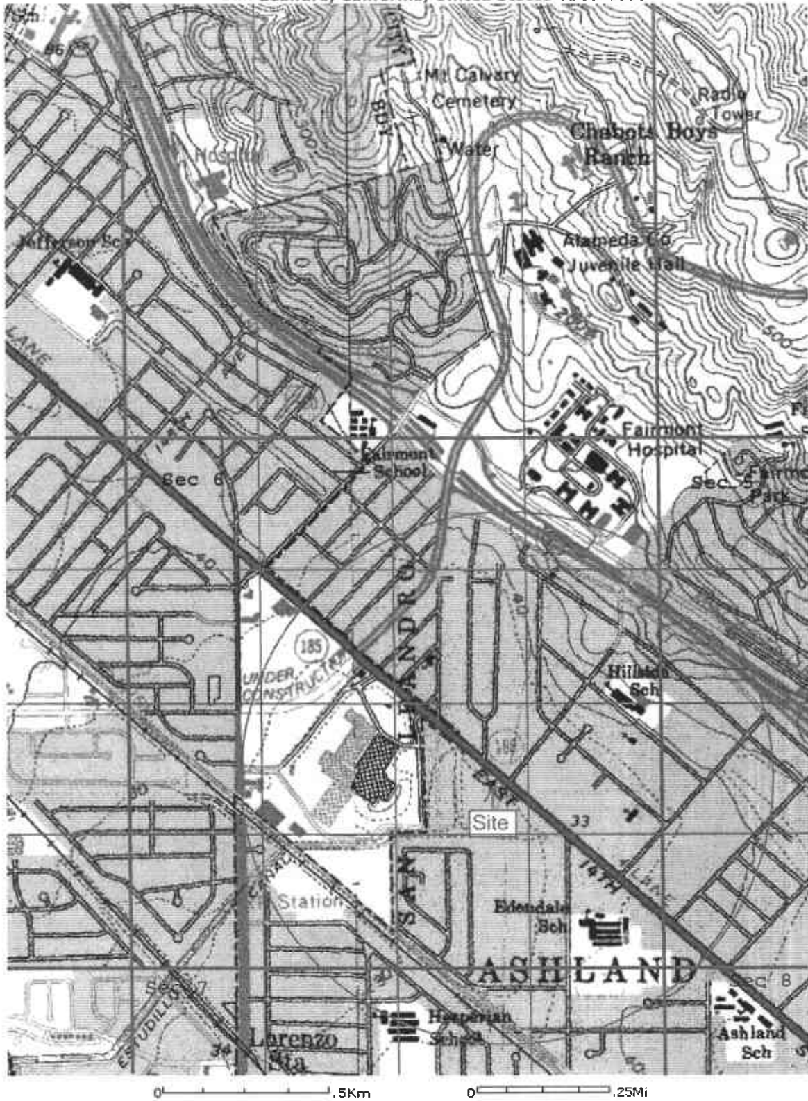
Image courtesy of the U.S. Geological Survey © 2004 Microsoft Corporation. Terms of Use Privacy Statement

USGS San Leandro, California, United States 01 Jul 1998