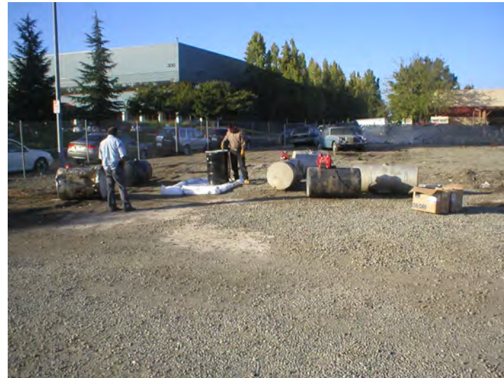
Photo 2. Removal of Diesel Fuel from Saddle Tanks