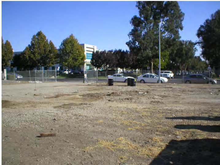
Photo 1. Saddle Tank Area after cleanup