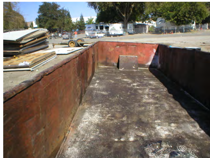
Photo 4. Rolloff Bin condition prior to removal from site