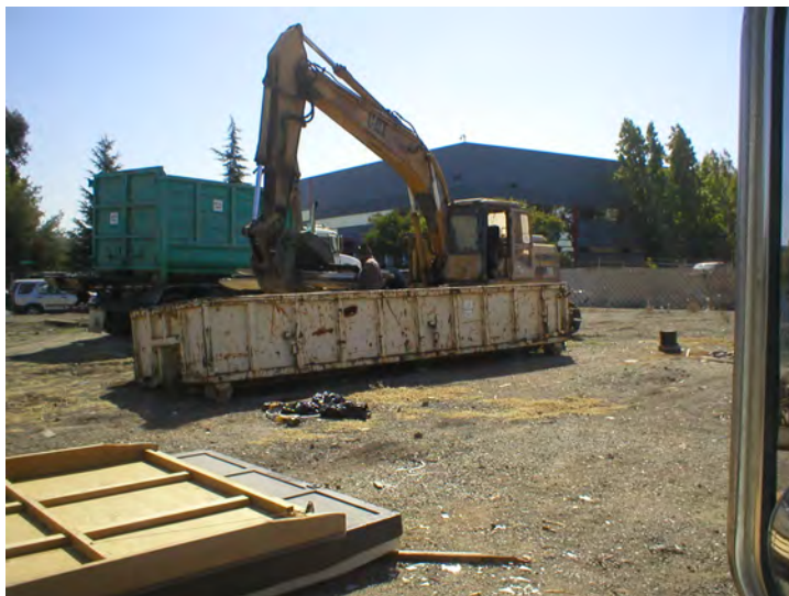
Photo 3. Removal of Oily Scrap Metal from Rolloff Bin