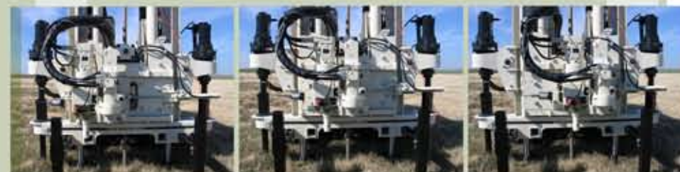
A hydraulic side-shift function centers the GH62 Hammer and Augerhead over the work area for direct push environmental sampling or logging.

Multi-purpose platform allows for collecting of environmental soil and groundwater samples from the same machine (upper photo). All machine operations performed using wireless remote or from control panel on the machine.