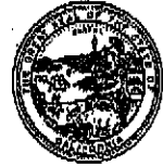
Arnold Schwarzenegger Governor

1001 I Street - Sacramento, California 95814 P.O. Box 944212 - Sacramento, California - 94244-2120 (916) 314-5714 • FAX (916) 341-5806 • www.waterboards.ca.gov/cwphone/ustef