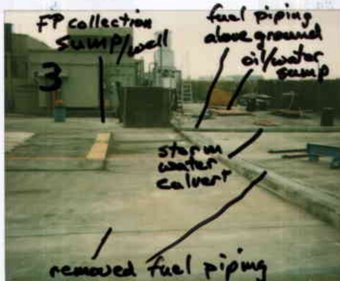
NAC Test site