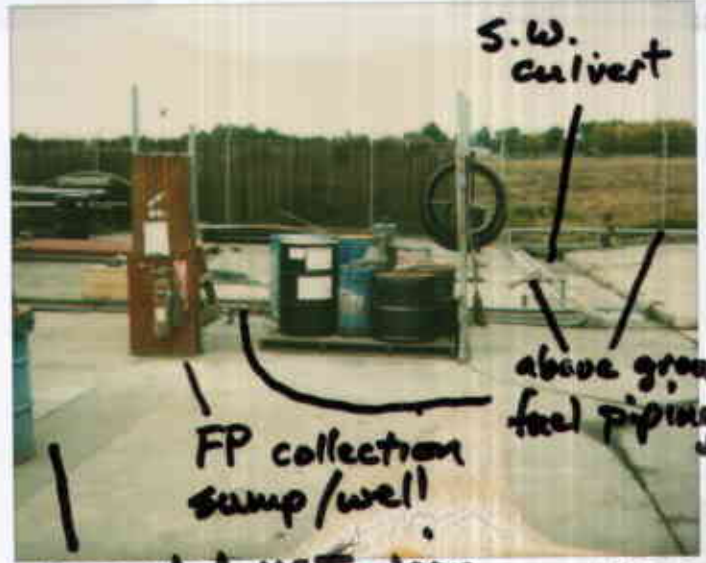
upgraded UST piping NAC Test site