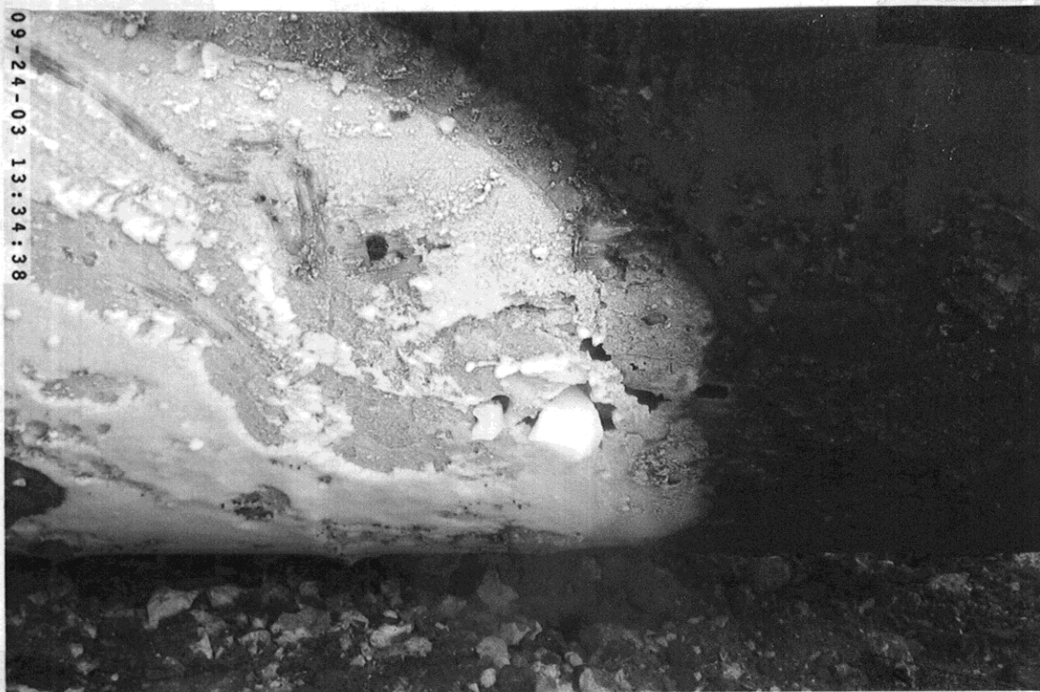
Hole in UGT

UGT Removed 1043 W. MacArthur Blvd Emerg. 9/24/03