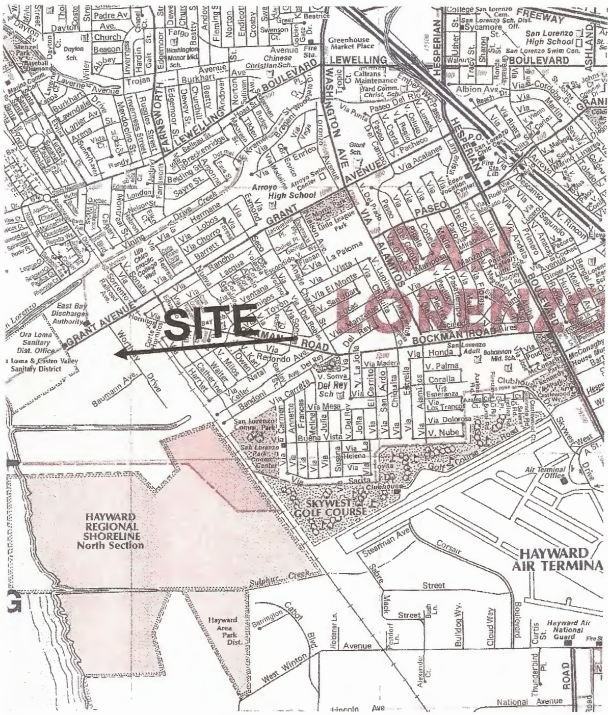
VICINITY MAP 15651 Worthley Dr., San Lorenzo, CA SCALE: 1" = 0.5 miles BY: Environmental Restoration Services PO Box 2006, Menlo Park, CA 94026 FIGURE 1