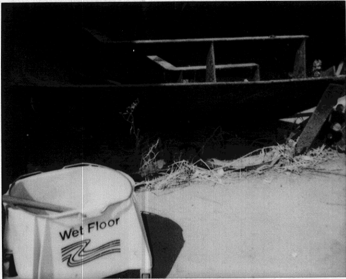
Sump at 22217 (?) Meekland - Hayward. Buettner & Hoyt property - next to Vicker's concrete. 5-30-91