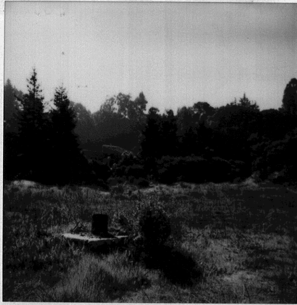
Stockpile soil (SE)