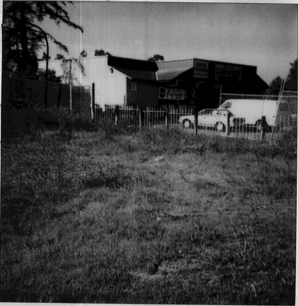
Looking SW @ north end of property MW-3 + B-8 visible