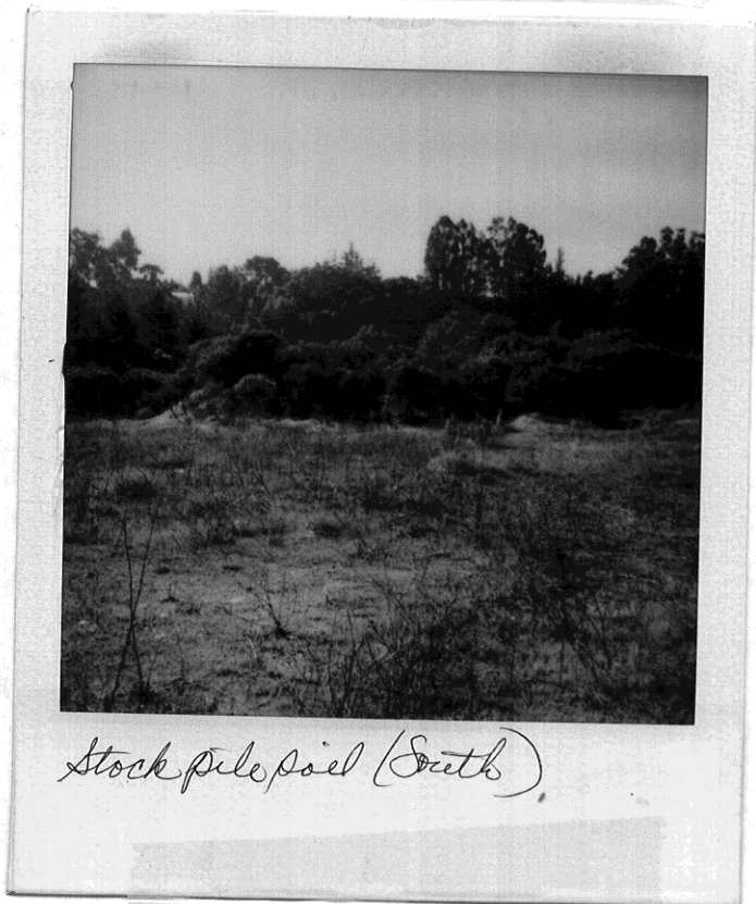
Stock pile soil (South)