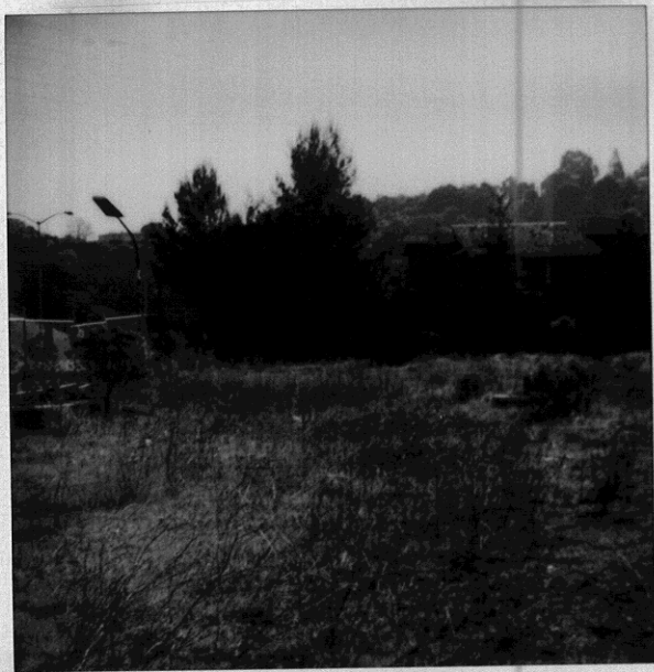
Fuel island area + townhomes in background.