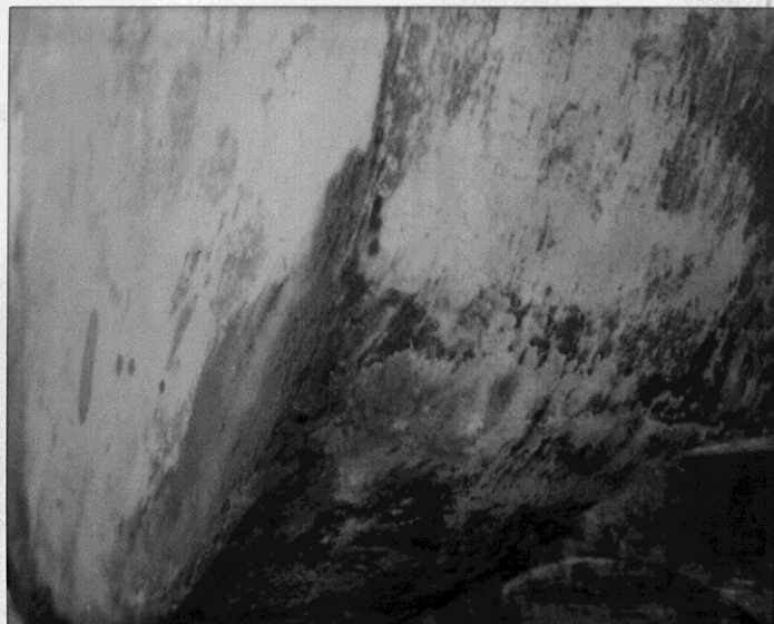
Weyerhaeuser 1/2" hole in 1000GAL 2/7/91 11:30am W. Faulhaber Tank Numbered 5569 by ERKSON