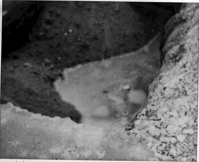
2/7/91 11am Weyerhaeuser 3x1000 gal tank X.