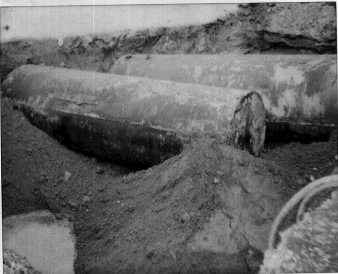
Weyerhaeuser 3x1000 GAL X. 2/7/91 11am W. Faerber