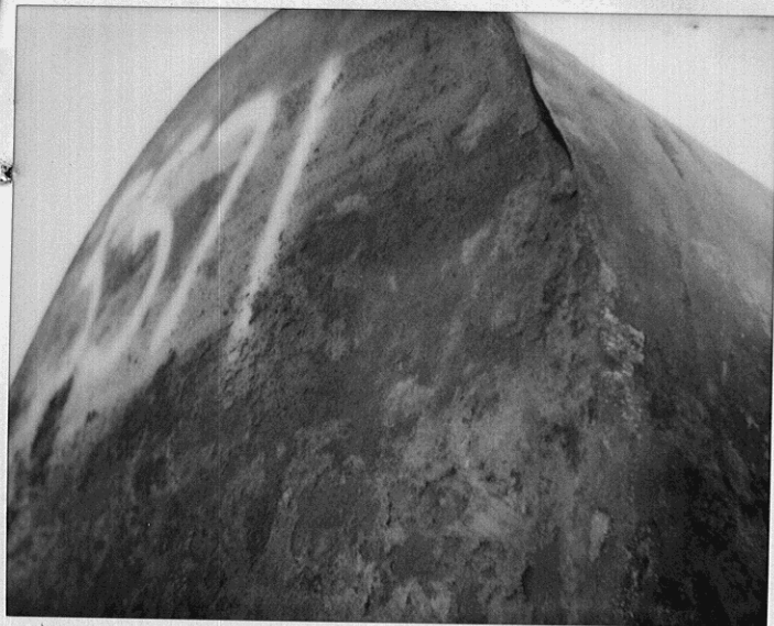
Weyerhaeuser 5" hole in 1000GL tank No. 5571 2/7/91 12pm Faulhaber