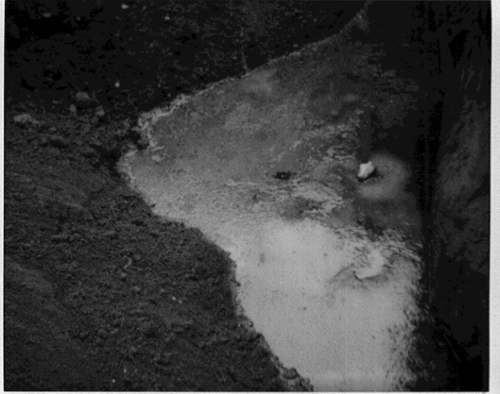
Weyerhaeuser 3x1000 GAL X. 2/7/91 11am W. Faerber