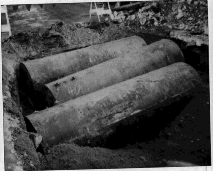
Weyerhaeuser 3x1000GL tank X. South Excavation. 2/7/91 10am