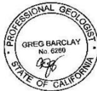
Greg Barclay, PG 6260