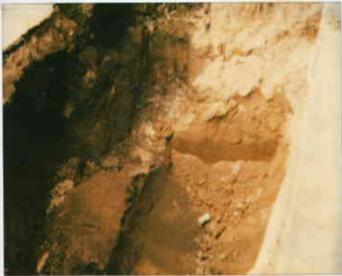
Pit from waste oil tank (500-gal). Lim/Former Exxon, 250-8th St, Oak 94607