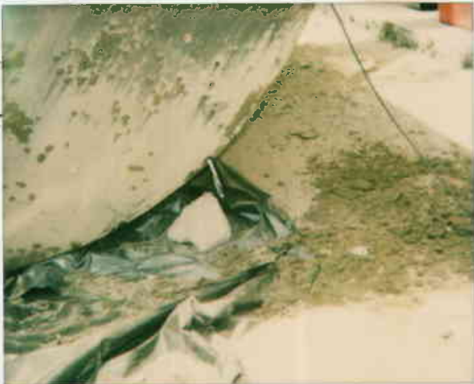
Hole in 10,000-gal gas tank Lim/Former Exxon, 250-8th St, Oak 94607