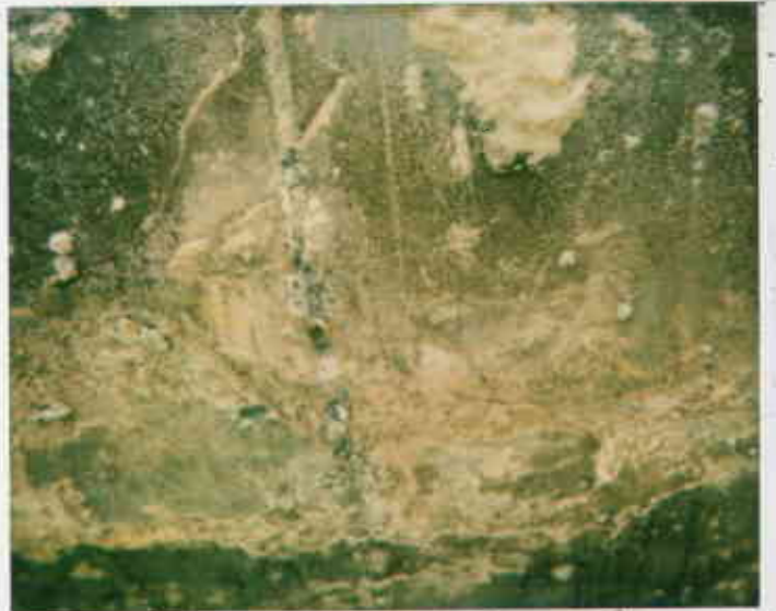
Pitting along seam in 10,000-gal gas UST. Lim/Former Exxon, 250-8th St, Oak 94607