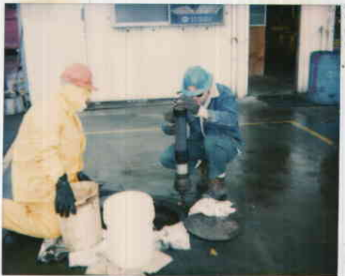
2-17-94 UPRR, 1750 Ferro St, Oakland RW being bailed