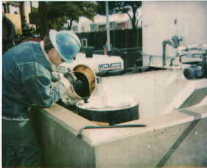
2-17-94 UPRR 1750 Ferro St, Oakland transfer of recovered oil