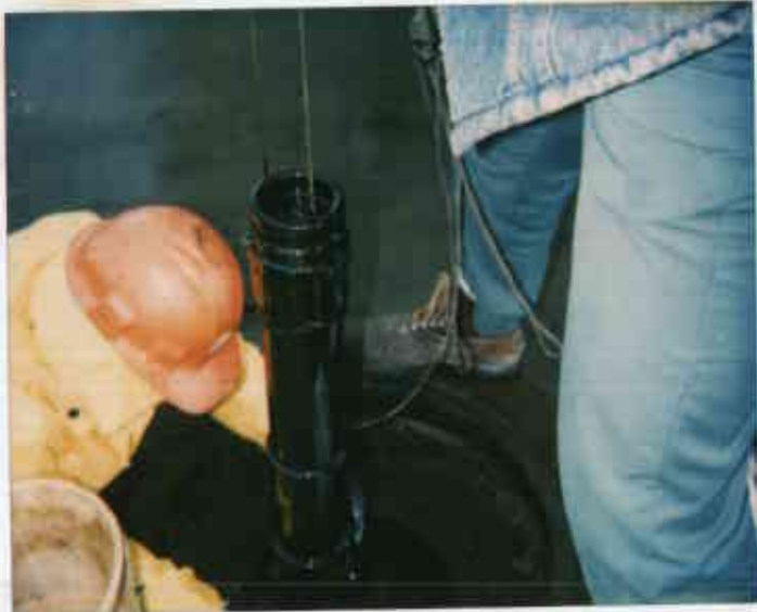
2-17-94 Union Pacific RR gje 1750 Ferro St., Oakland RW being backhoed