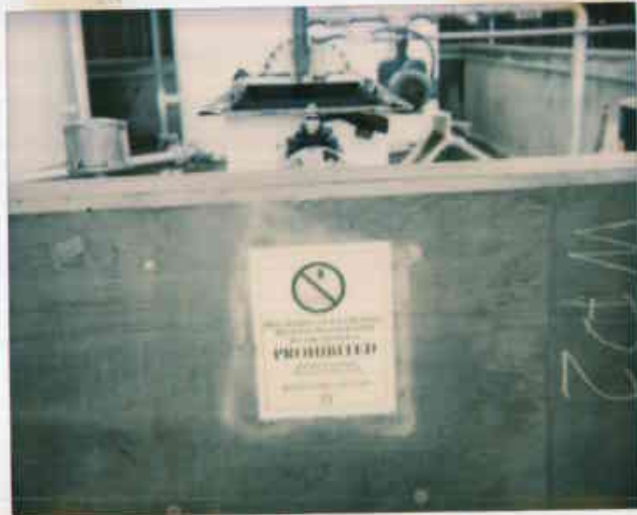
2-17-94 UPRR, 1750 Ferro St., gje Oakland bermed area w/ASTs