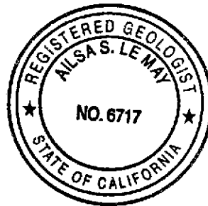
Ailsa S. Le May, R.G. Senior Geologist

Figure: 1 - Ground Water Elevation Contour Map