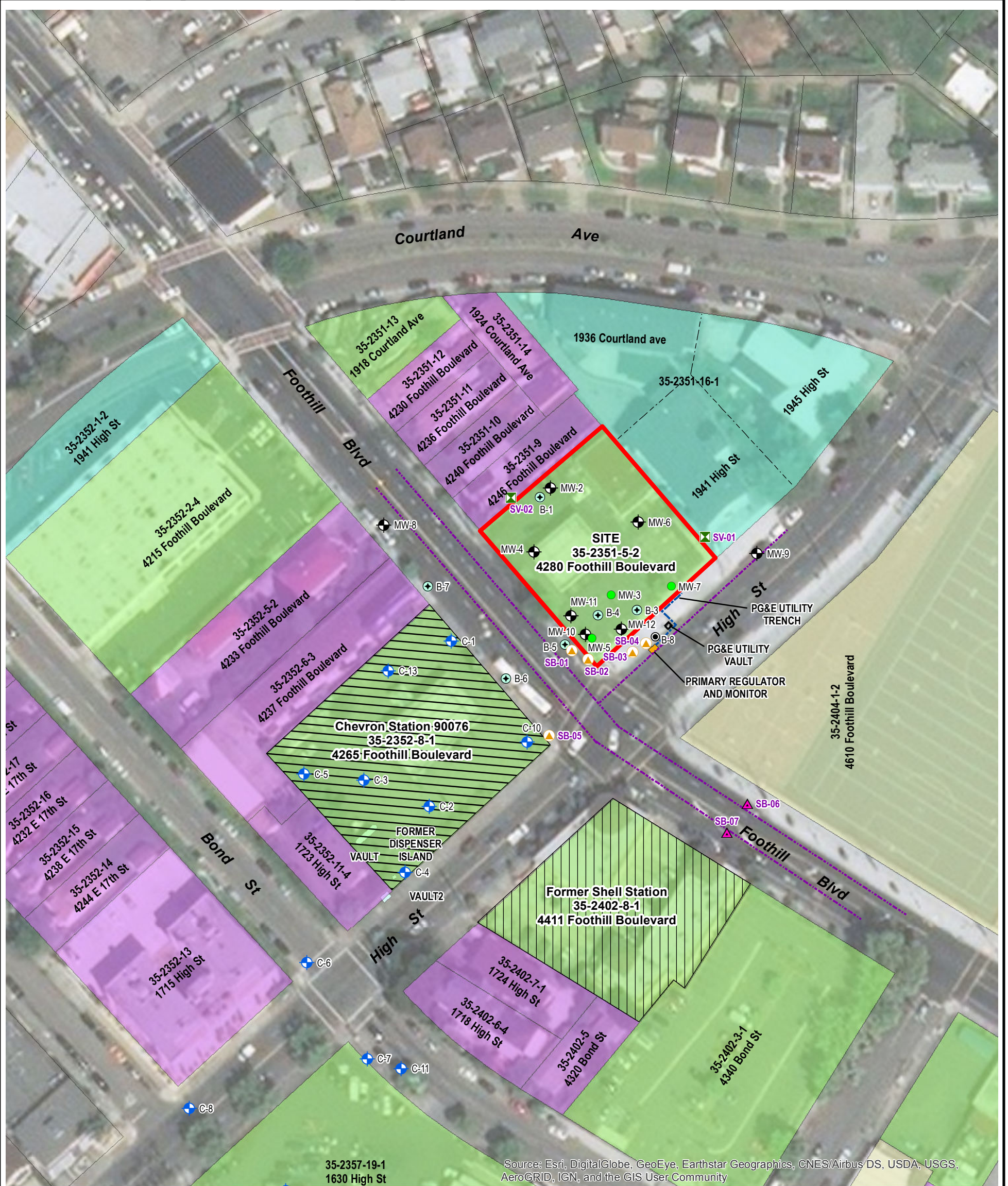
Source: Esri, DigitalGlobe, GeoEye, Earthstar Geographics, CNES/Airbus DS, USDA, USGS, AeroGRID, IGN, and the GIS User Community