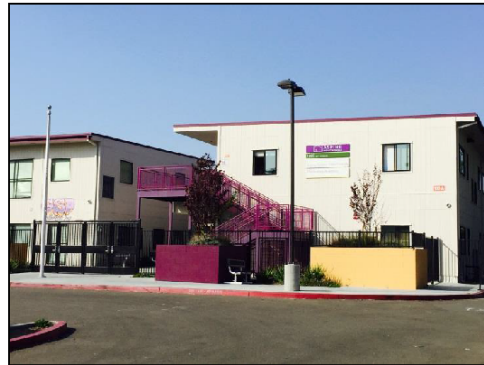
En los próximos meses, estaremos llevando a cabo trabajo ambiental en Aspire School.

Antes de que Aspire School fuera construida, el sitio fue investigado y limpiado para que fuera una propiedad adecuada y segura para una escuela. Esto incluyó la eliminación de un tanque subterráneo de almacenamiento de gasolina, tierra y aguas subterráneas contaminadas, y la instalación de asfalto, hormigón y zonas jardineadas para evitar el contacto humano con cualquier tipo de contaminación que quedara en la tierra. La investigación y el trabajo de limpieza fueron supervisados por el Departamento de salud ambiental del Condado de Alameda (Condado de Alameda) y la Agencia de protección ambiental de los Estados Unidos (US EPA).