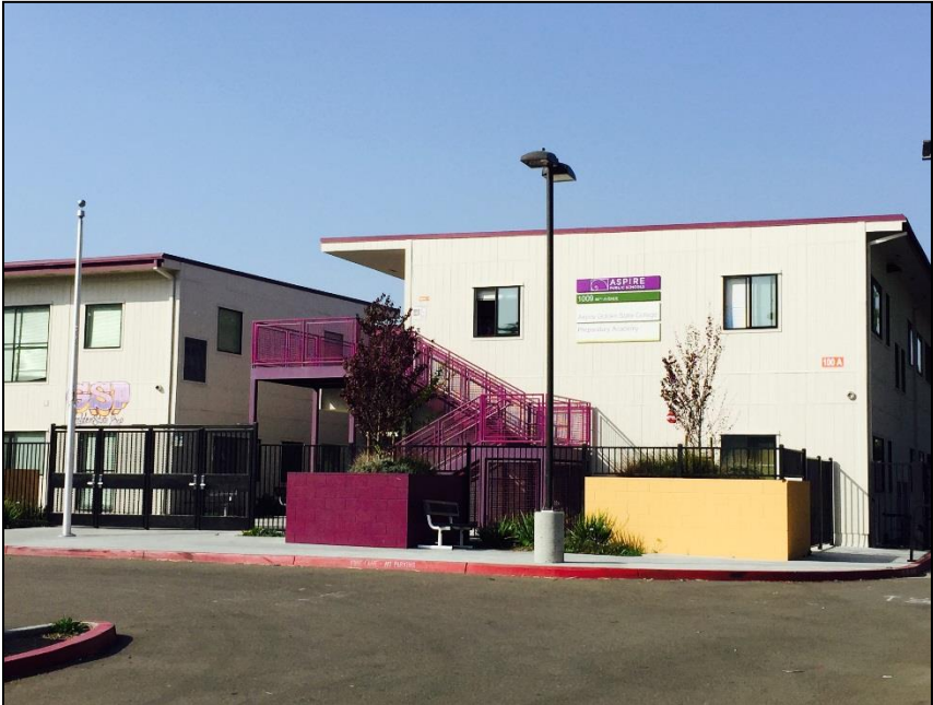
Aspire Golden State School