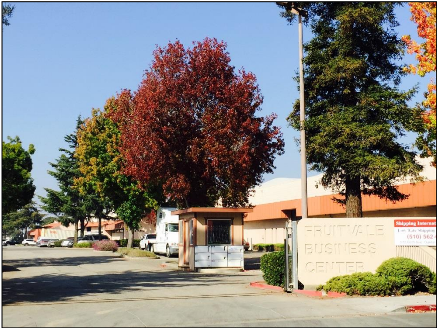
Industrial business center west of the site