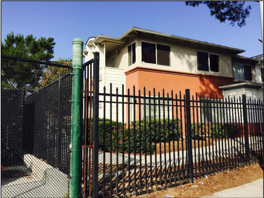
Affordable housing complex northeast of the site