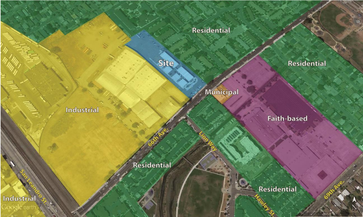
Figure 1 – Site Area Map