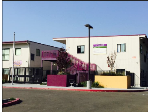
Over the next few months, we will be conducting some environmental work at Aspire School.

Before Aspire School was built, the site was investigated and cleaned up to make it a suitable and safe property for a school. This included the removal of an underground gasoline storage tank, contaminated soil and groundwater, and the installation of asphalt, concrete and landscaped areas to prevent human contact with any contamination that remained in soil. Investigation and cleanup work was overseen by the Alameda County Department of Environmental Health (Alameda County) and the US Environmental Protection Agency (US EPA).