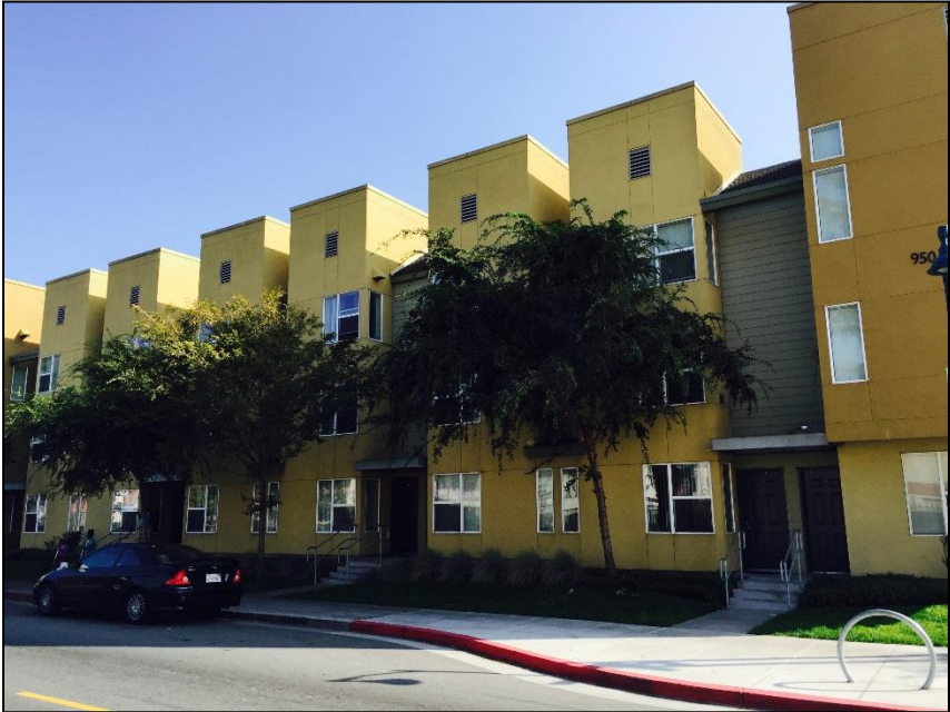
Affordable housing complex south of the site