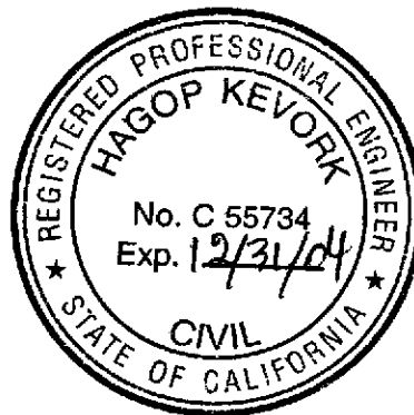
Hagop Kevork P.E. No. C55734

Figure 1: Potentiometric Map Table 1: Groundwater Monitoring Data and Analytical Results Attachments: Standard Operating Procedure - Groundwater Sampling Field Data Sheets Chain of Custody Document and Laboratory Analytical Reports