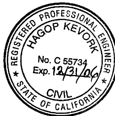
Hagop Kevork P.E. No. C55734

Figure 1: Potentiometric Map Table 1: Groundwater Monitoring Data and Analytical Results Table 2: Groundwater Analytical Results - Oxygenate Compounds Attachments: Standard Operating Procedure - Groundwater Sampling Field Data Sheets Chain of Custody Document and Laboratory Analytical Reports