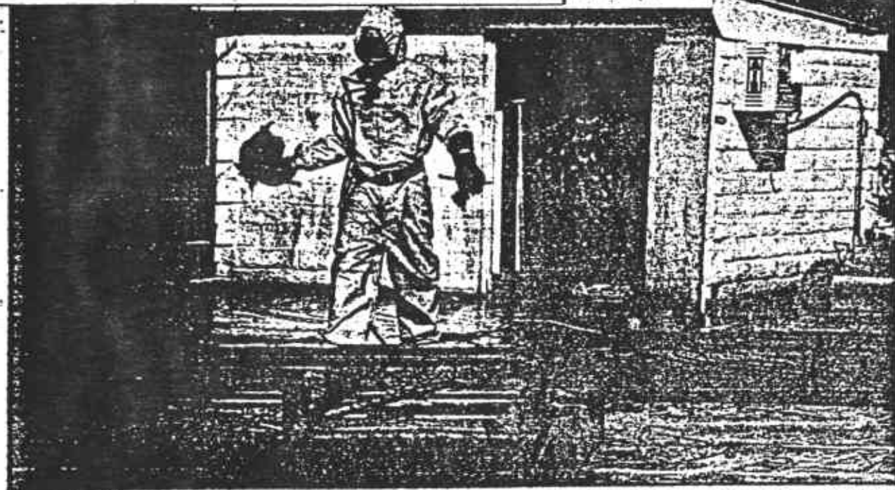
A member of the PIC Hazardous Spill Team cleans up a gasoline leak at the Pleasanton Arco station at First and Ray streets that also washed into Arroyo Del Valle.

last filled ground day. A pressure test will be conducted on the tank, he said, to determine if gasoline is still leaking. Fish and game officials were alerted to the incident by the Pleasanton Fire Department, which assisted in washing down the area. Workers from the PIC Hazardous Spill Team of Concord, called by Arco, vacuumed up gasoline and rainwater that had Please see LEAK, Page 2A