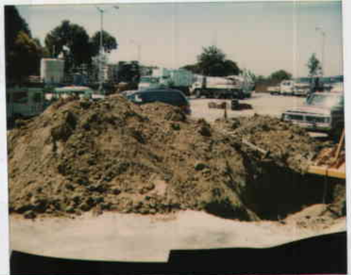
6/22/97 1K+500 gal 7101 Edgewater 01717328093-2W 0027 5851 COPIES & ENLARGEMENTS CALL 800-421-1030