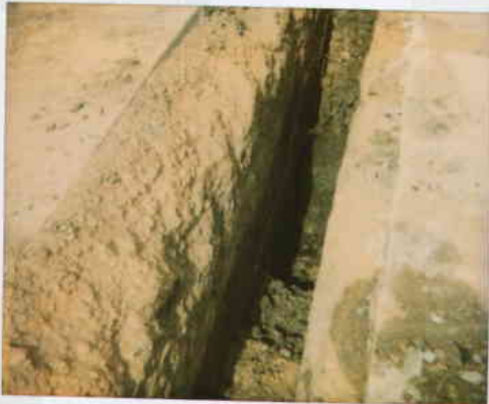
10/6/98 Phase II Piping run