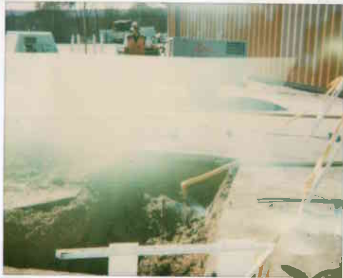
Flushing pipes 10/16/98