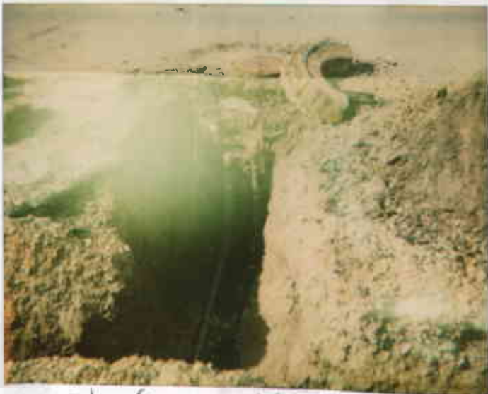
9/23/98 Exposed hydram cysts MSC 01717328093-2M 0026 5268 COPIES & ENLARGEMENTS CALL 800-421-1030