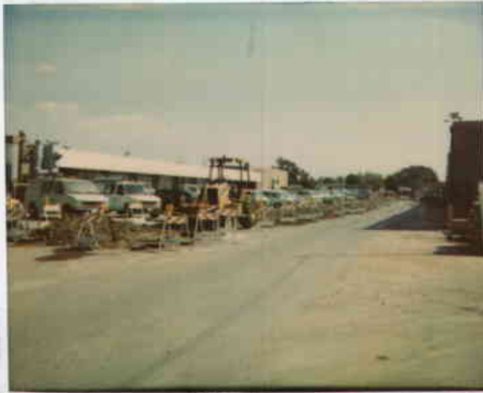
Phase I 9/23/98 MSC looking SE 01717328093-2M 0026 5278 COPIES & ENLARGEMENTS CALL 800-421-1030