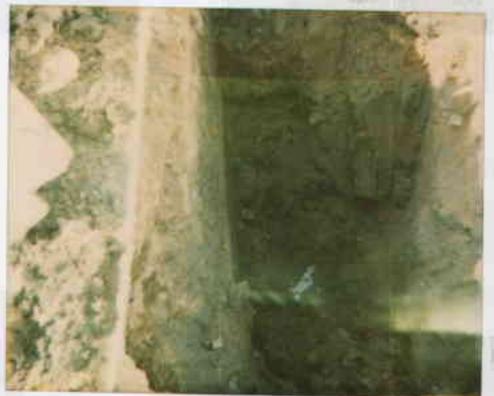
Disp area 0% mist 10/6/98 MSC