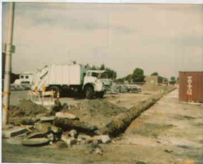
10/6/98 2nd piping phase removal MSC 01717328093-2W 0025 5261 disp. is land COPIES & ENLARGEMENTS CALL 800-421-1030