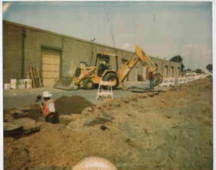
9/23/98 MSC south → north Phase I hydram lines being excavated 01717328093-2M 0026 5258 COPIES & ENLARGEMENTS CALL 800-421-1030