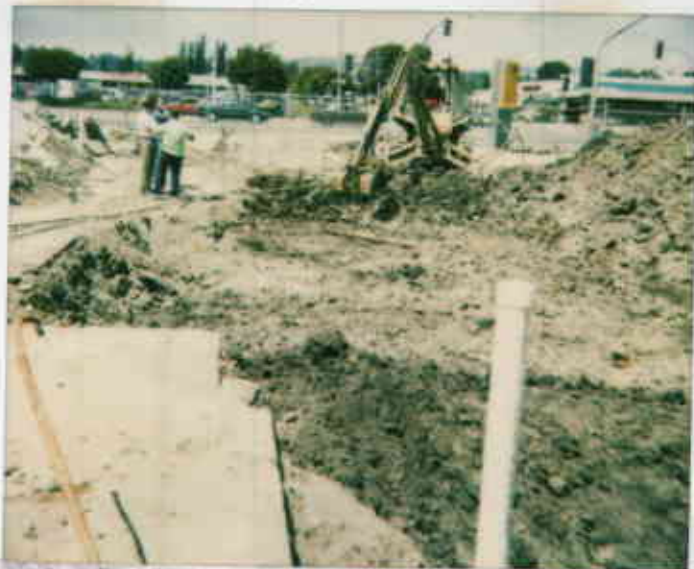
02216306128 8 Xtra Oil 7/29/92 3495 CV Blvd