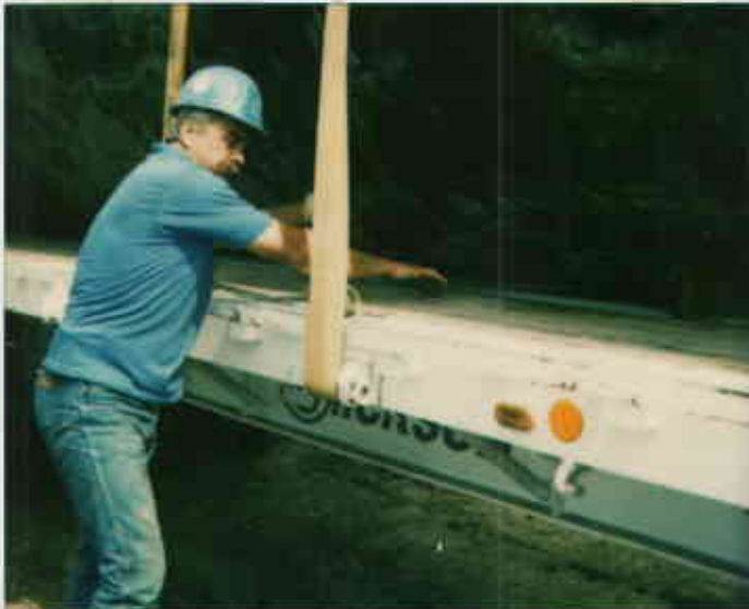
plugging hole in super unleaded tank

02216206128 8 7-16-92 Xtra Oil 3495 CV Blvd Castro Valley