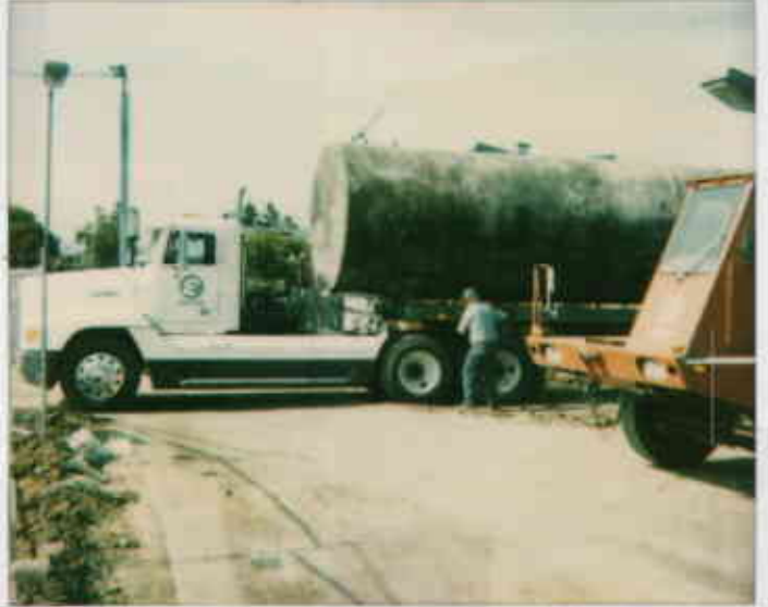
Super 104 unleaded UST # 9163

02216206128 8 7-16-92 Xtra Oil 3495 CV Blvd Castro Valley