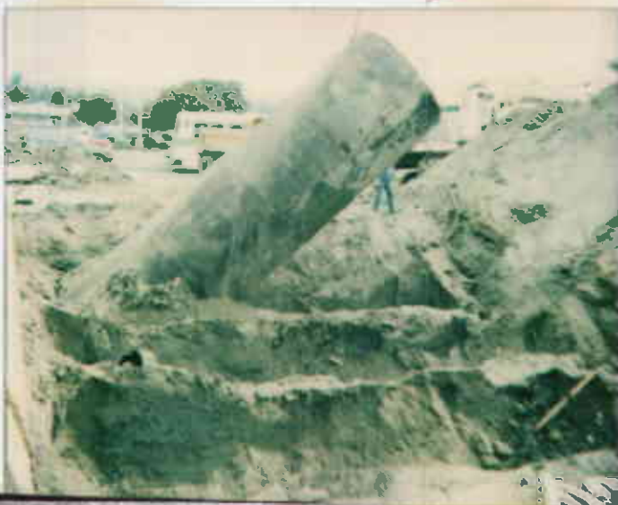
Super unleaded tank (north end of pit)

02216306128 B 7-16-92 Xtra Oil 3485 CV Blvd Castro Valley