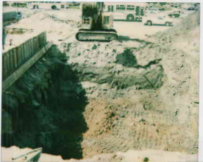
view of UST pit towards the north CV Blvd.

02216206128 B 7-16-92 Xtra Oil 3485 Castro Valley Bl Castro Valley