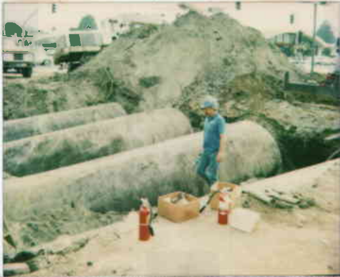
view to NE from SW corner of site

02216206128 B 7-16-92 Xtra Oil 3485 Castro Valley Bl Castro Valley