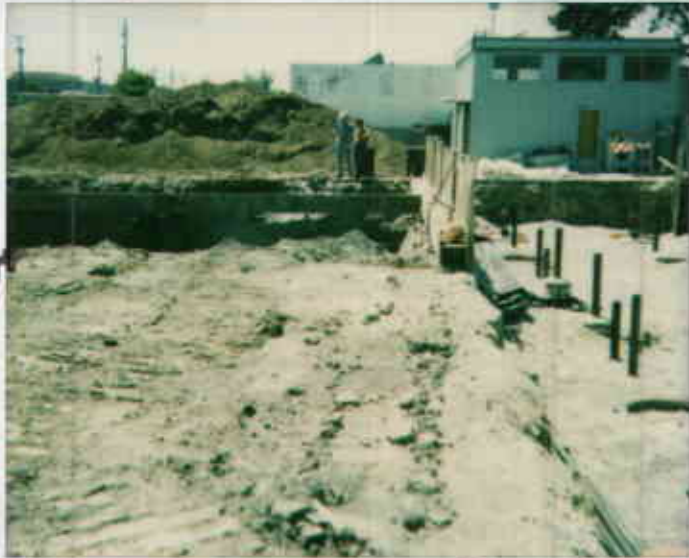
Old UST pit