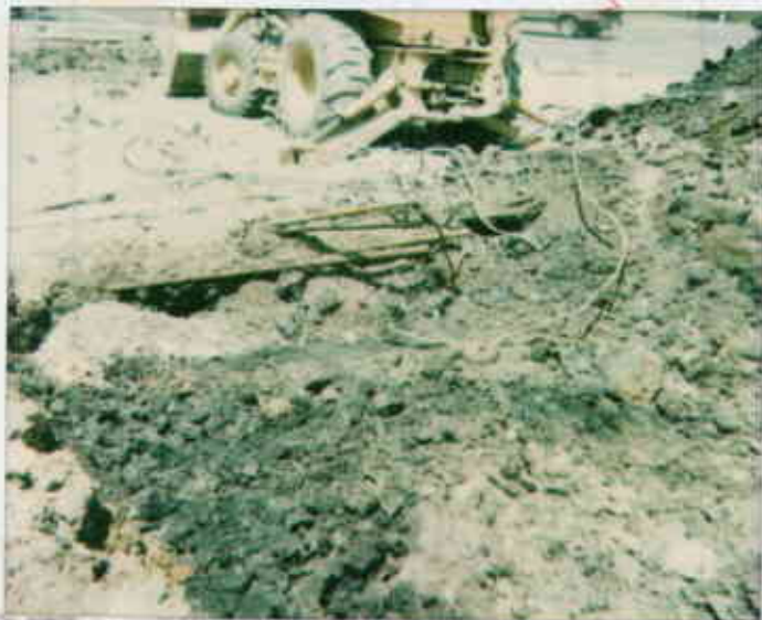
02216306128 8 Xtra Oil 7/29/92 3495 CV Blvd