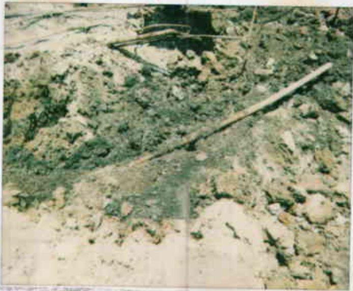
02216306128 8 Xtra Oil 7/29/92 3495 CV Blvd