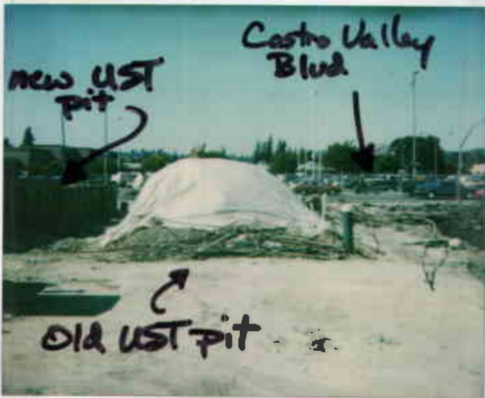
fuel island over- excavation

03216211255-8 7/29/92 Xtra Oil 3495 CV Blvd