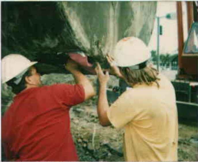
attempting to plug hole in super-leaded UST

02216206128 8 7-16-92 Xtra Oil 3495 CV Blvd Castro Valley