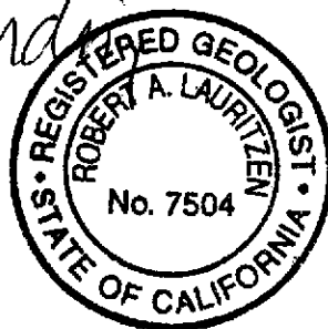
Robert A. Lauritzen Senior Geologist, R.G. No. 7504

Figure 1: Groundwater Elevation Map Table 1: Groundwater Monitoring Data and Analytical Results Table 2: Groundwater Analytical Results - Oxygenate Compounds Attachments: Standard Operating Procedure - Groundwater Sampling Field Data Sheets Chain of Custody Document and Laboratory Analytical Reports