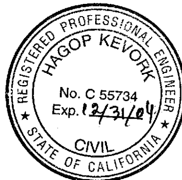
Hagop Kevork P.E. No. C55734

Figure 1: Groundwater Elevation Map Table 1: Groundwater Monitoring Data and Analytical Results Table 2: Groundwater Analytical Results - Oxygenate Compounds Attachments: Standard Operating Procedure - Groundwater Sampling Field Data Sheets Chain of Custody Document and Laboratory Analytical Reports