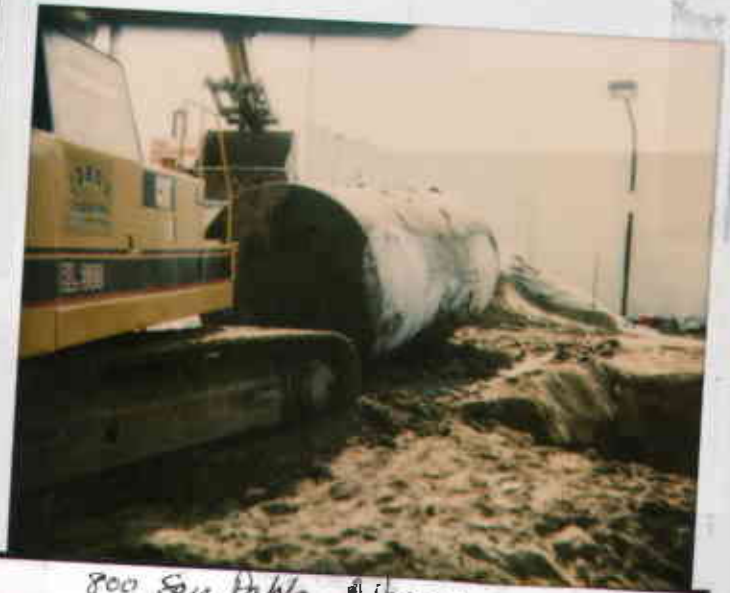
800 San Pablo, Albany 3/5/97 6,000-gallon UST. No holes 10617123989-2W 1358 7133 observed COPIES & ENLARGEMENTS CALL 800-421-1030