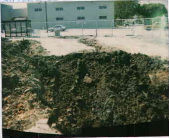
Foreground Abandoned JST Pit Background Pipe Trench to dispenser