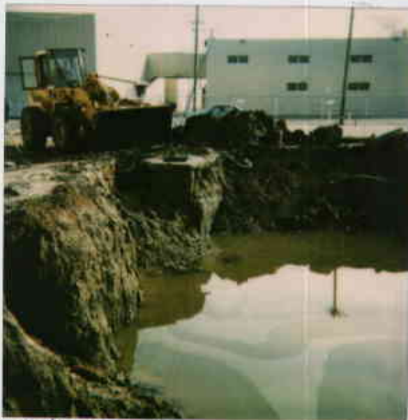
Looking South. Add'l pump discovered during OE activities. May believe it may lead to a w/o VST. 12/14/95 View of OE area of former pump