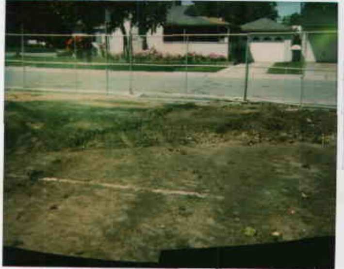
UST pit filled in w/ backfill material