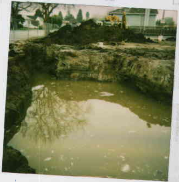
2/7/96 AREA C 575 Pasco Grande San Lorenzo