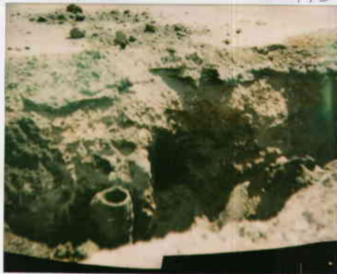
4" Cast iron pipe discovered in pipe trench