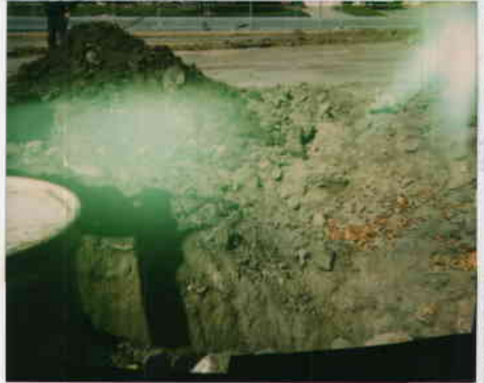
Grease Sump Pit