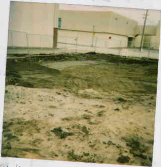
2/7/96 SUMP AREA 575 Pasco Grande San Lorenzo A