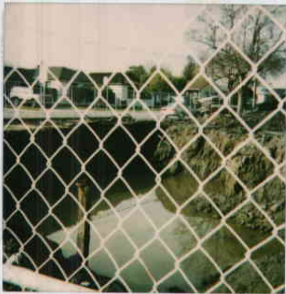
View of former pump island/pipe trench OE area. Looking Northwest. 12/14/95