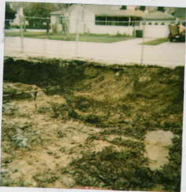
2/7/96 AREA B 575 Pasco Grande San Lorenzo