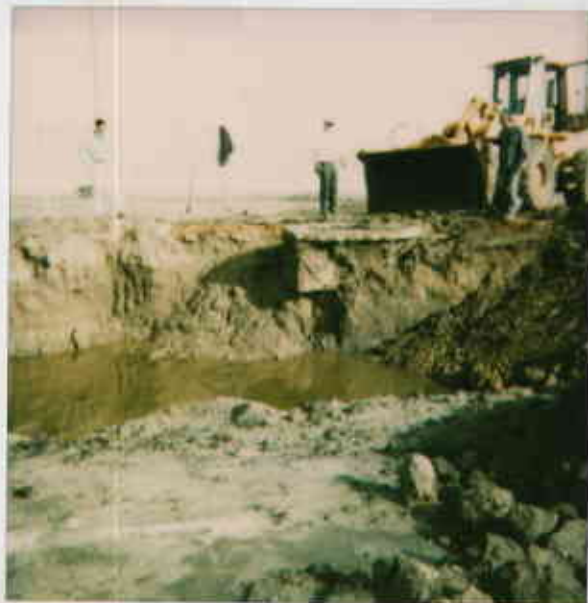
View of add'l pump discovered during OE activities looking east. 12/14/95