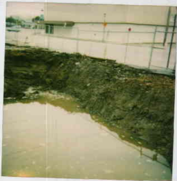
2/7/96 AREA D 575 Pasco Grande San Lorenzo