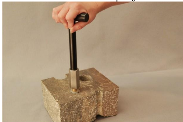
Figure 7. Removing the VAPOR PIN®