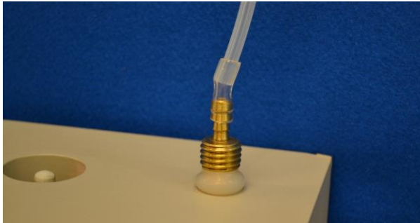
Figure 5. VAPOR PIN® sample connection

Nylaflow tubing as close to the VAPOR PIN® as possible to minimize contact between soil gas and Tygon™ tubing.