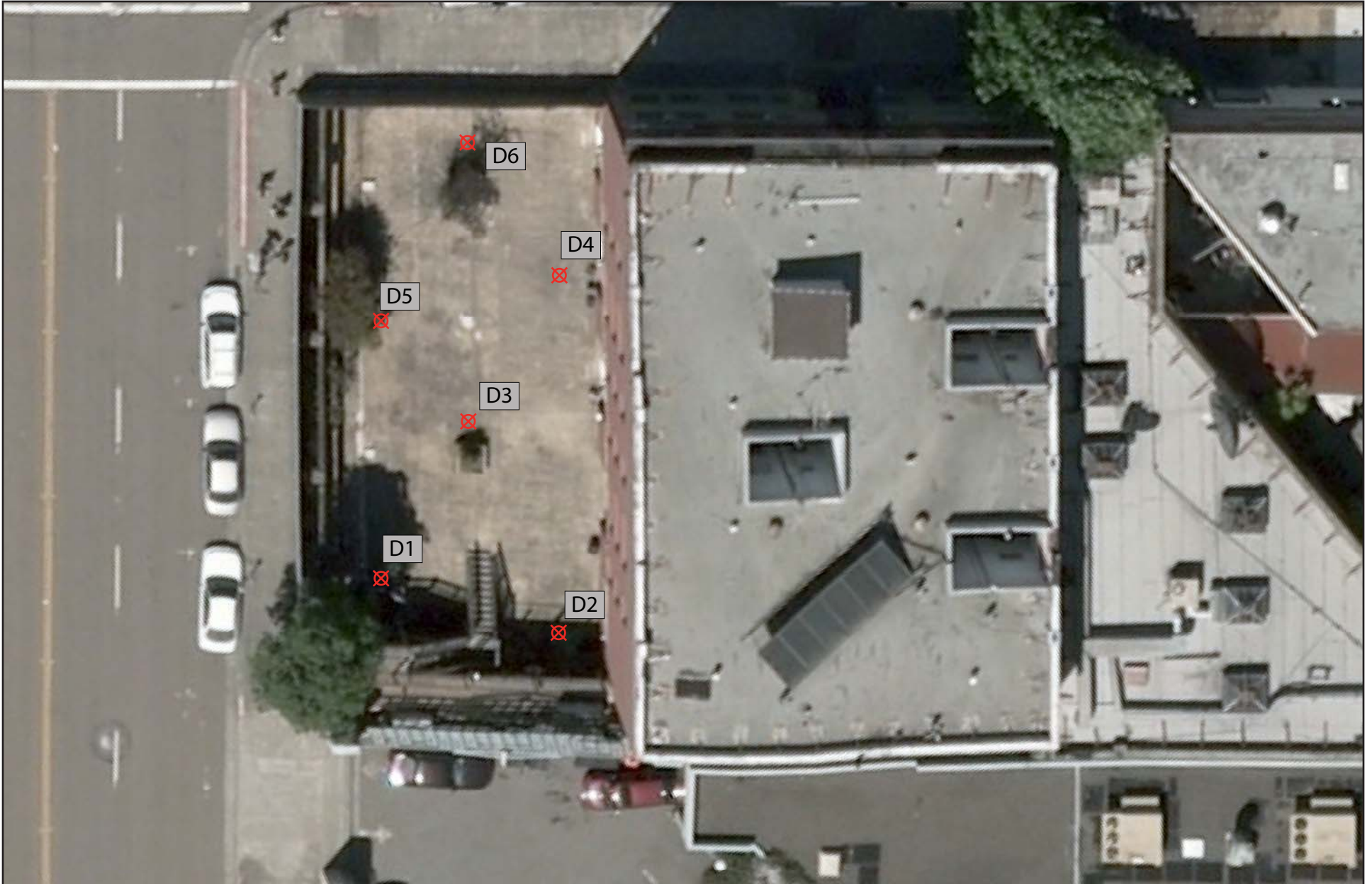
Figure 1 Proposed Boring Locations 581 18th Street, Oakland, CA