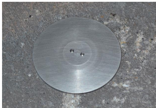
Figure 4. Secure Cover Installed