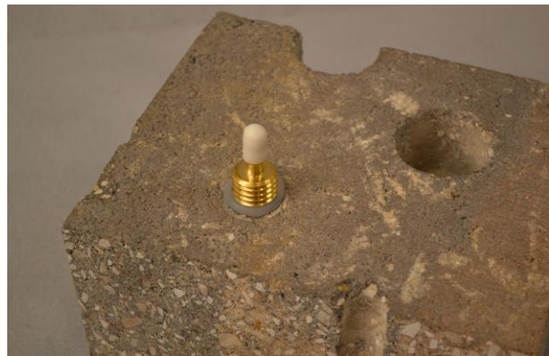
Figure 3. Installed VAPOR PIN®

During installation, the silicone sleeve will form a slight bulge between the slab and the VAPOR PIN® shoulder. Place the protective cap on VAPOR PIN® to prevent vapor loss prior to sampling (Figure 3).