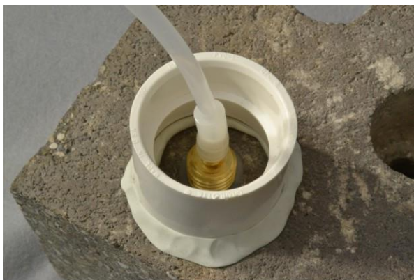
Figure 6. Water dam used for leak detection

10) Conduct leak tests in accordance with applicable guidance. If the method of leak testing is not specified, an alternative can be the use of a water dam and vacuum pump, as described in SOP Leak Testing the VAPOR PIN® via Mechanical Means (Figure 6). For flush-mount installations, distilled water can be poured directly into the 1 1/2 inch (38mm) hole.