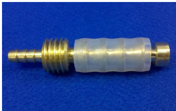
Figure 1. Assembled VAPOR PIN®