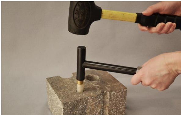
Figure 2. Installing the VAPOR PIN®

During installation, the silicone sleeve will form a slight bulge between the slab and the VAPOR PIN® shoulder. Place the protective cap on VAPOR PIN® to prevent vapor loss prior to sampling (Figure 3).