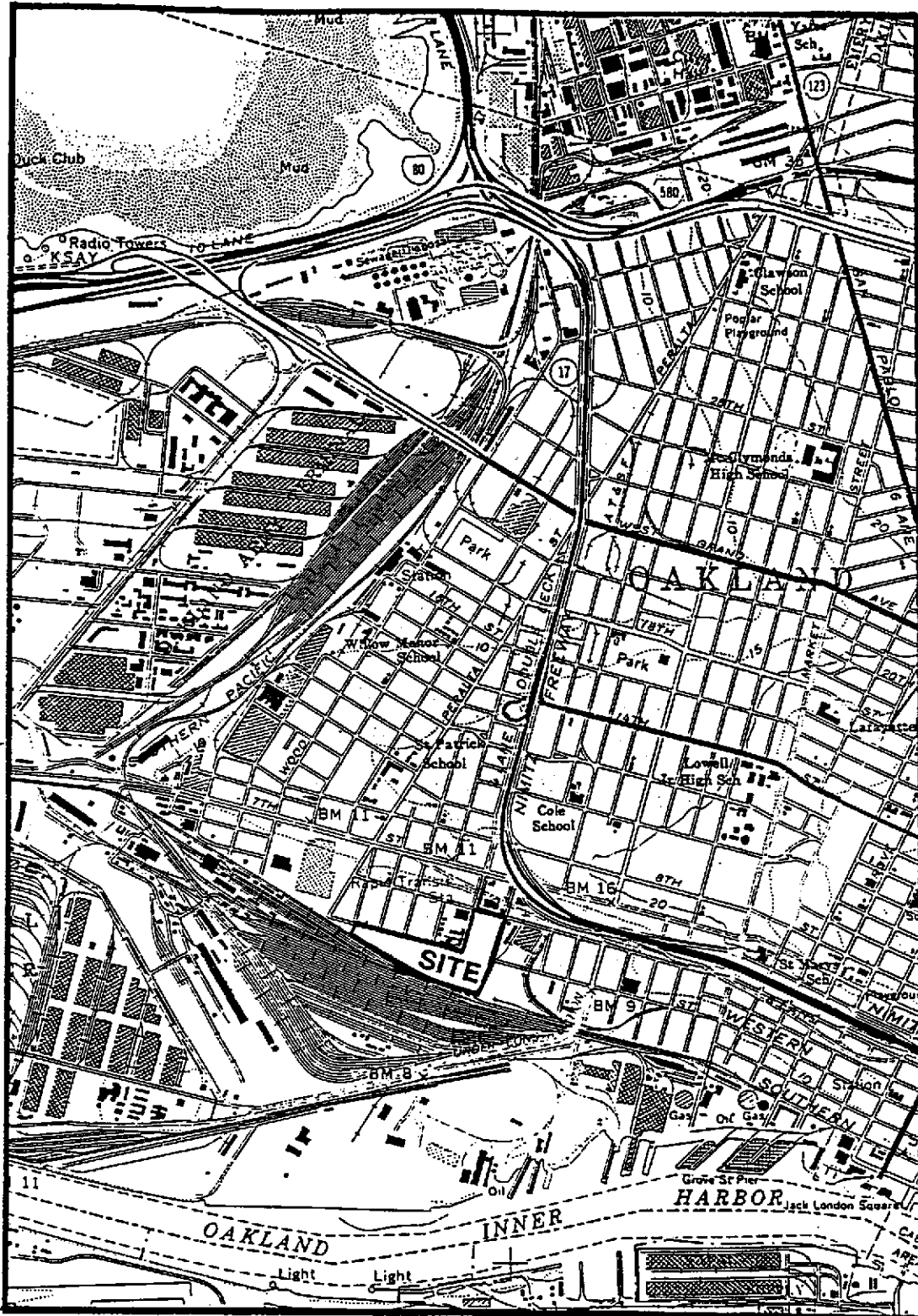
FIGURE 1 USGS TOPOGRAPHIC MAP