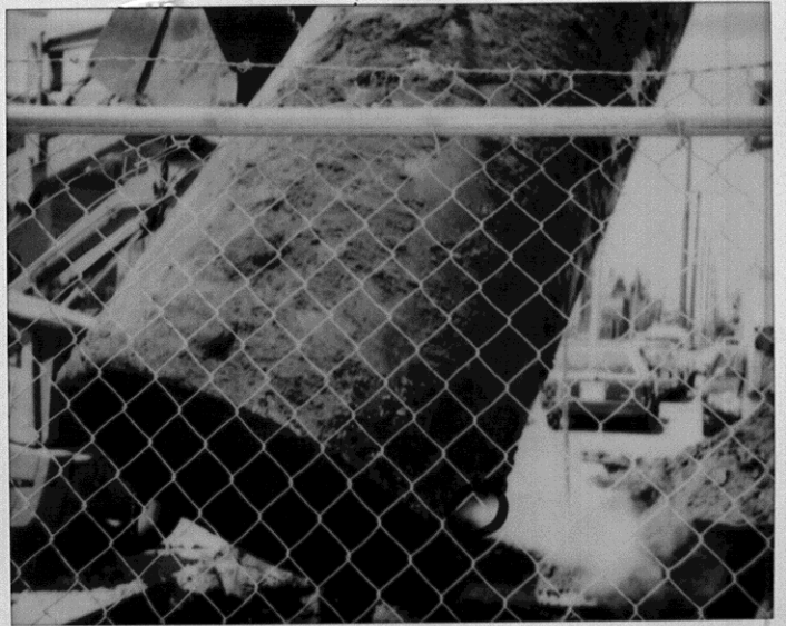
Hole w/ CO 2