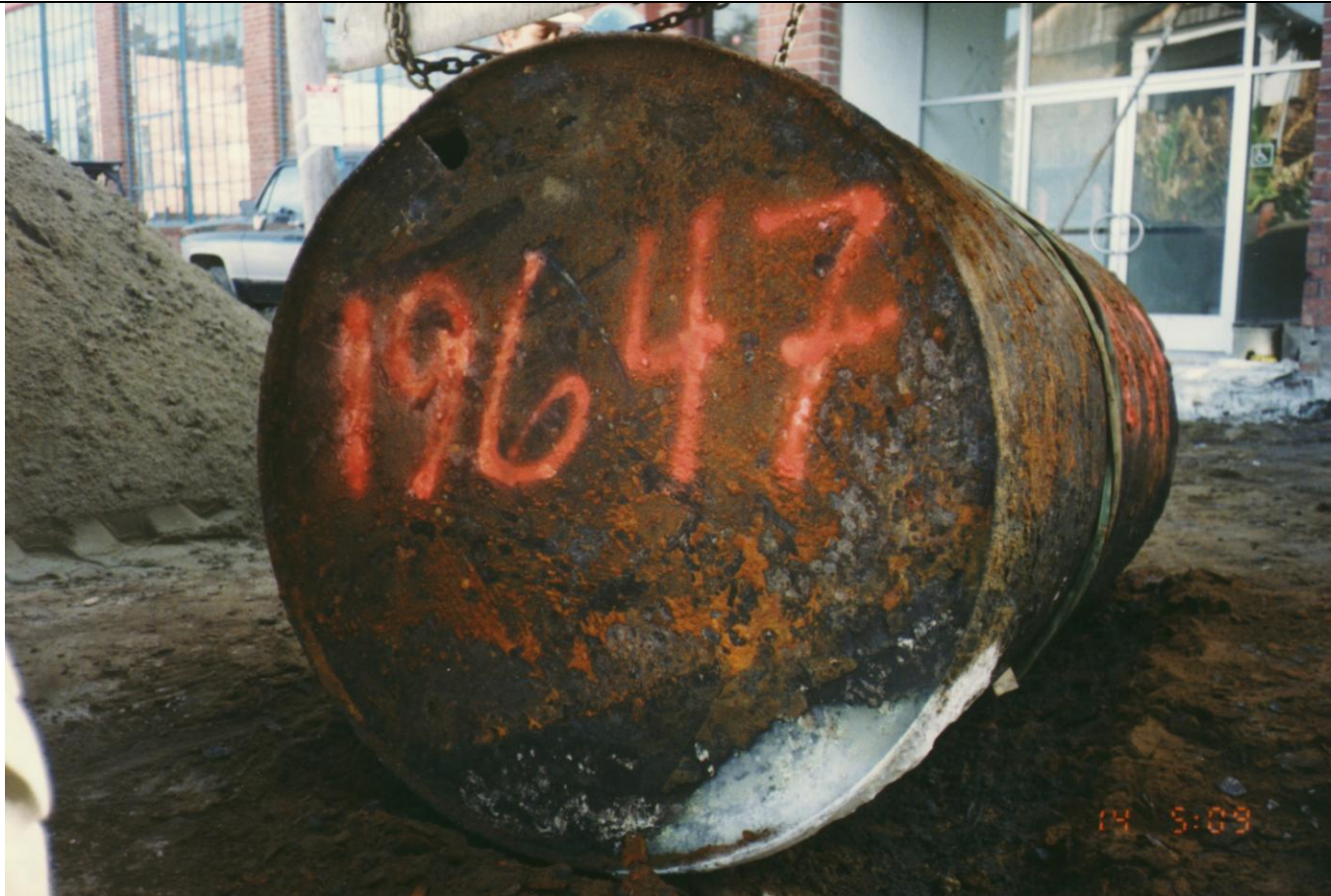
Underground storage tank (UST) removed from 1397 55 th Street, Emeryville. Imported sand used to backfill the excavation is shown to the left of the UST.