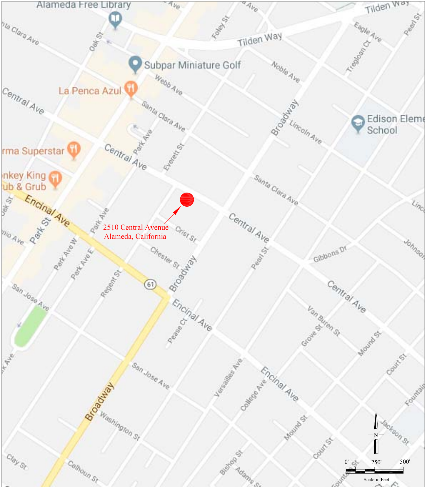
Figure 1 Vicinity Map