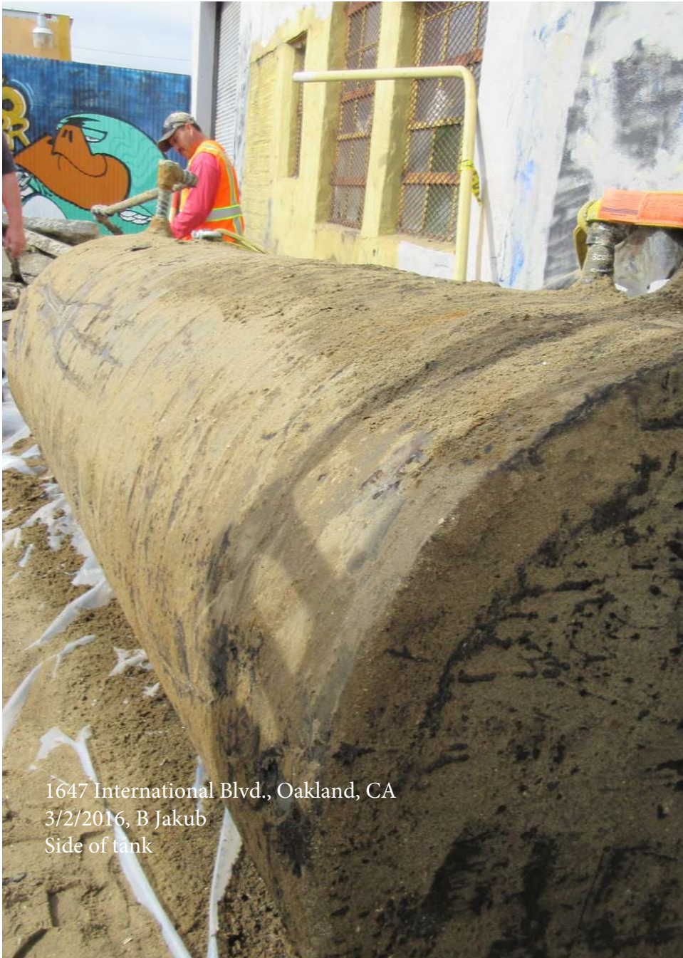
1647 International Blvd., Oakland, CA 3/2/2016, B Jakub Side of tank