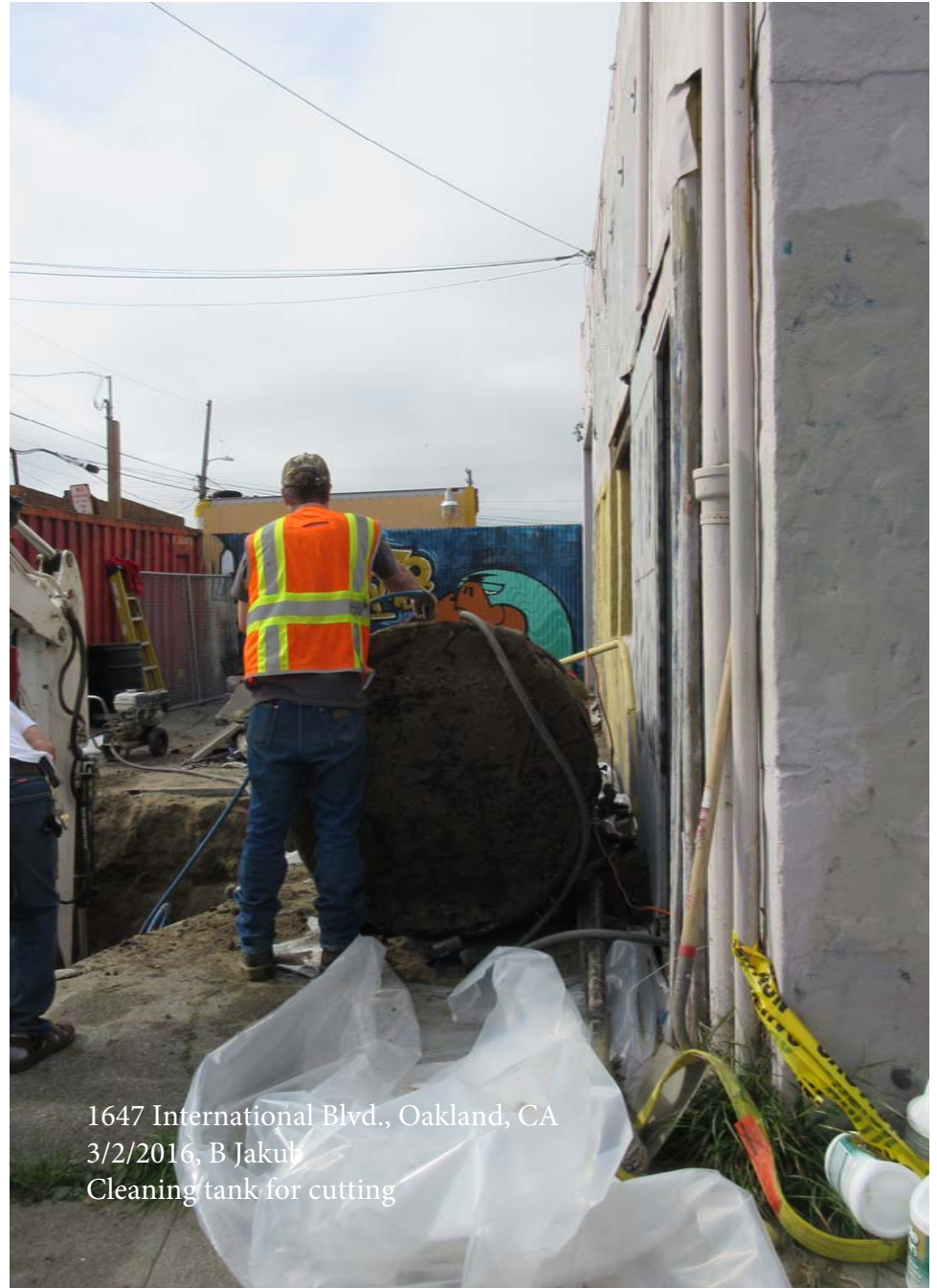
1647 International Blvd., Oakland, CA 3/2/2016, B Jakub Cleaning tank for cutting