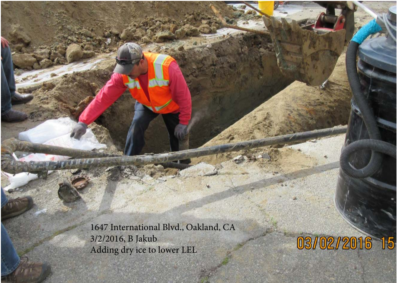
1647 International Blvd., Oakland, CA 3/2/2016, B Jakub Adding dry ice to lower LEL