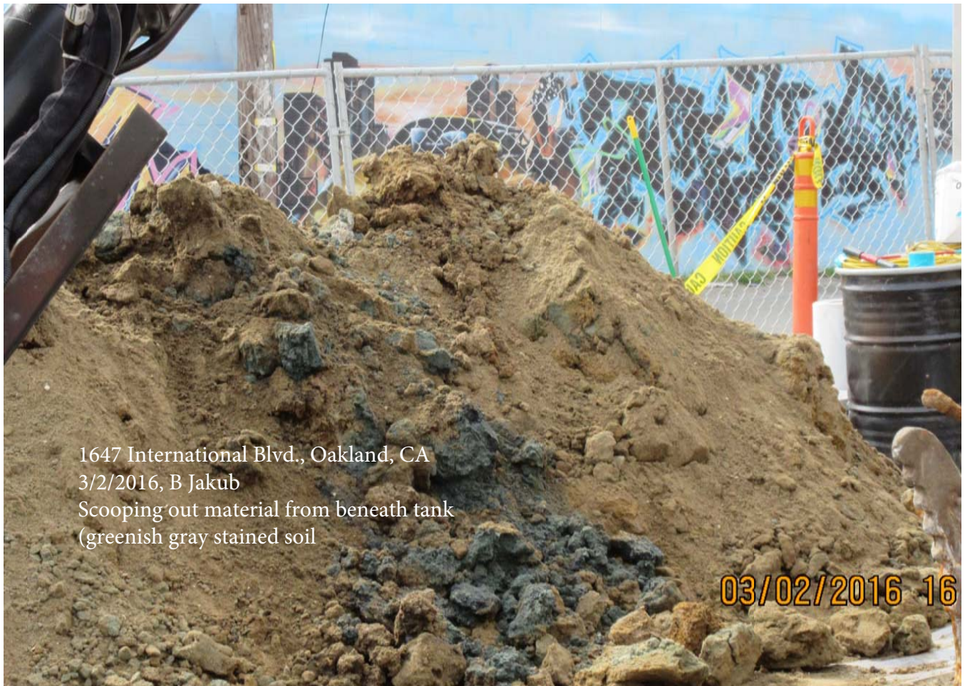
1647 International Blvd., Oakland, CA 3/2/2016, B Jakub Scooping out material from beneath tank (greenish gray stained soil)