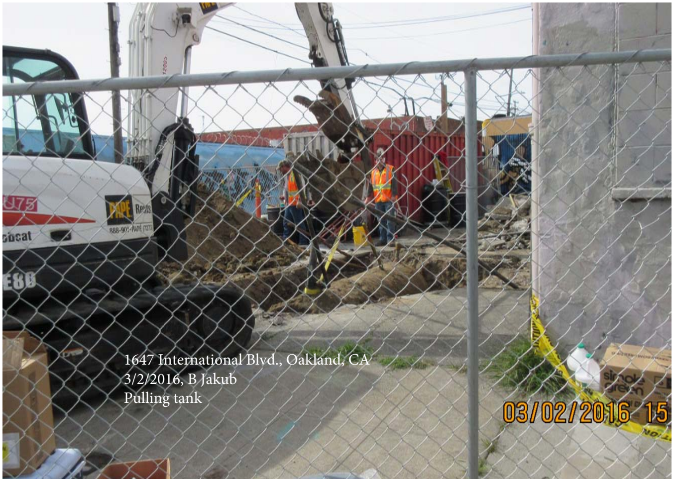
1647 International Blvd., Oakland, CA 3/2/2016, B Jakub Pulling tank