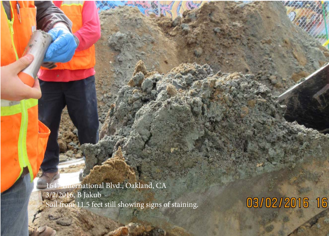
1647 International Blvd., Oakland, CA 3/2/2016, B Jakub Soil from 11.5 feet still showing signs of staining.