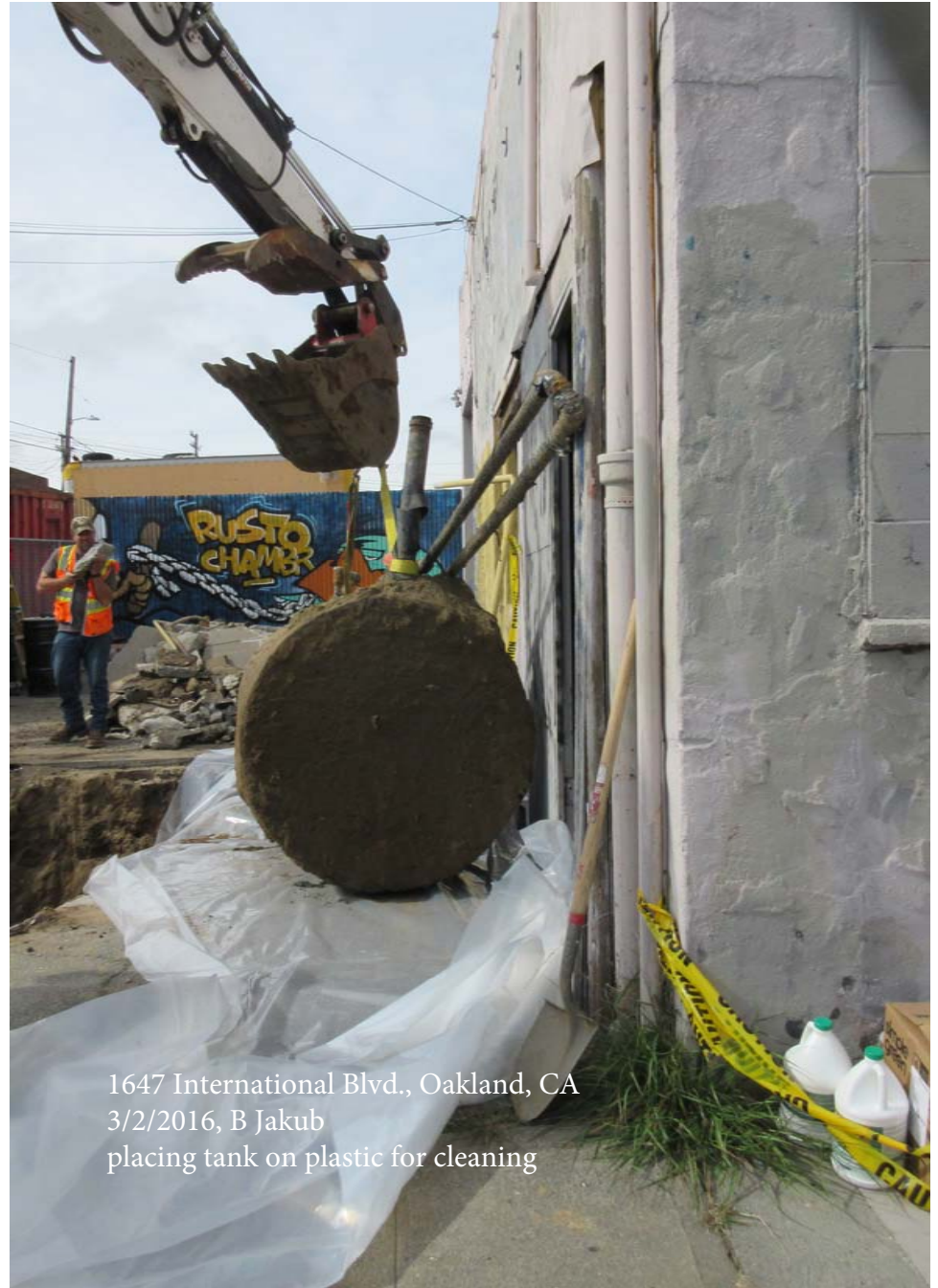
1647 International Blvd., Oakland, CA 3/2/2016, B Jakub placing tank on plastic for cleaning