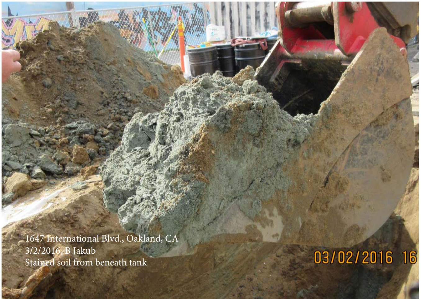
1647 International Blvd., Oakland, CA 3/2/2016, B Jakub Stained soil from beneath tank