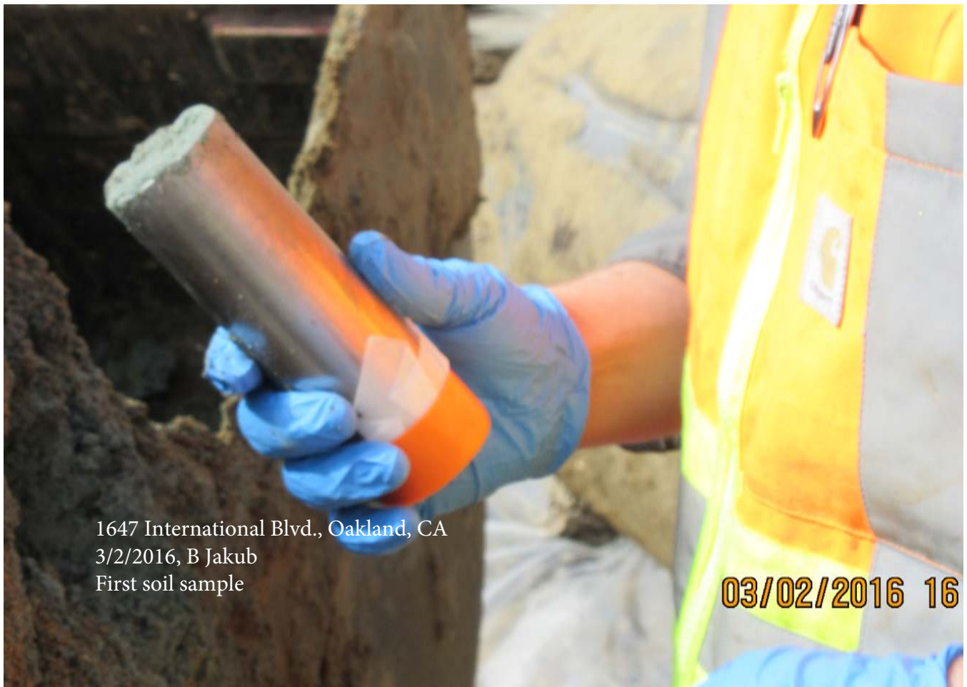
1647 International Blvd., Oakland, CA 3/2/2016, B Jakub First soil sample