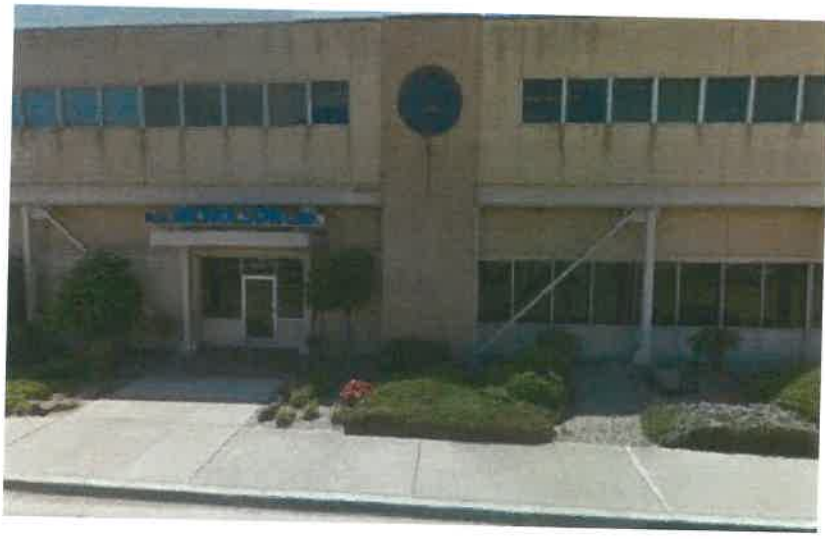
24747 Clawiter Rd Hayward, CA 94545