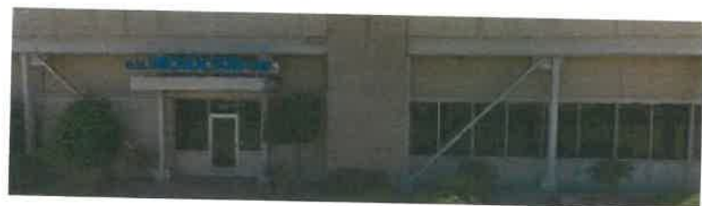
At this location