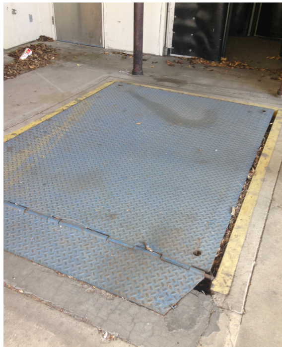
Photo 14: View of hydraulic hoist on the west of the Subject Property.

Project: Phase I ESA 1625 Chestnut St. Livermore, California