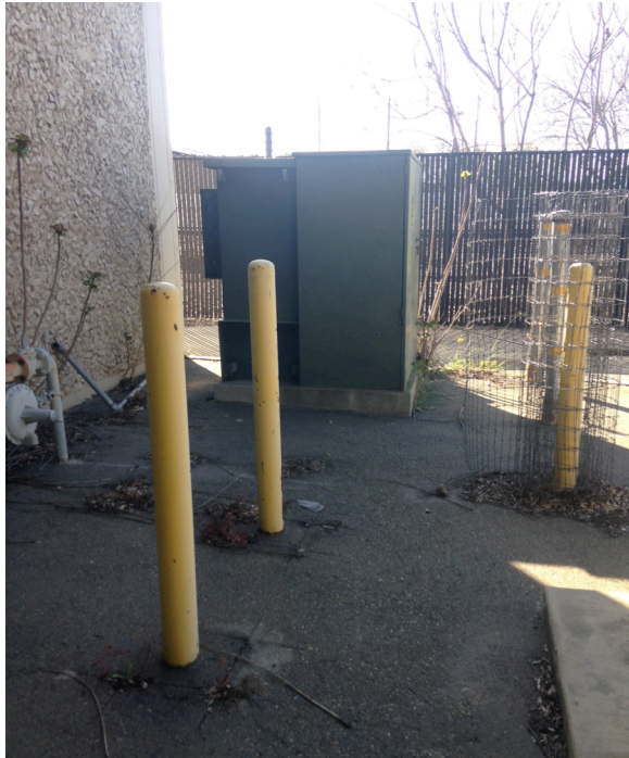
Photo 13: View of an electrical transformer on the west of the Subject Property.