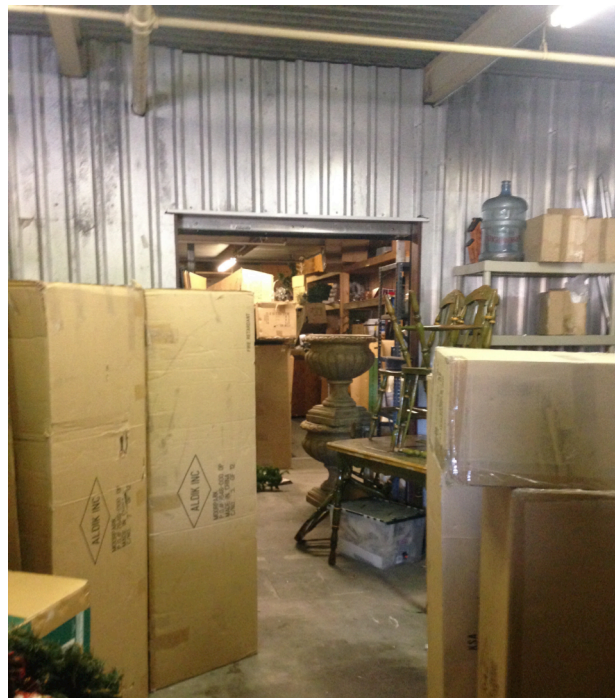
Photo 16: View of storage container on the west portion of the Subject Property.

Project: Phase I ESA 1625 Chestnut St. Livermore, California