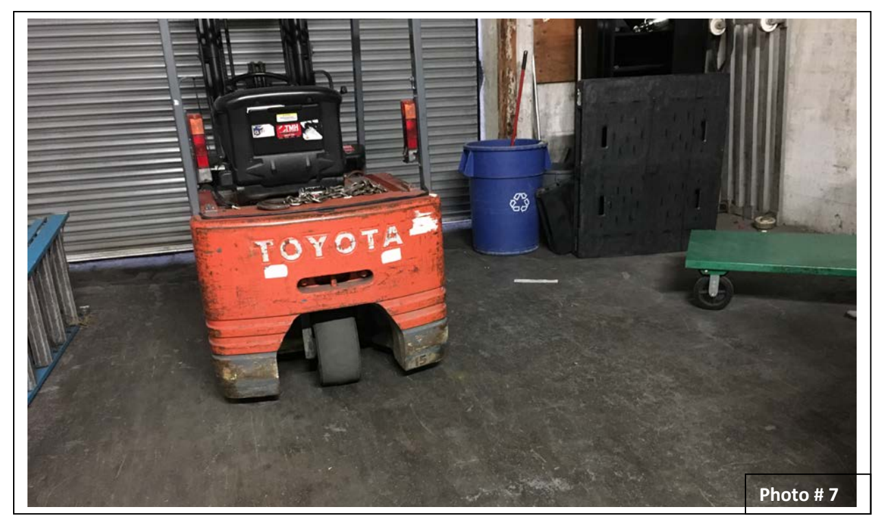
Insp. Rtp #: Date: 11/9/2017 Description: Loading roll-up door where UST is suspected to be closed-in-place.

DEPARTMENT OF ENVIRONMENTAL HEALTH LOCAL OVERSIGHT PROGRAM (LOP) For Hazardous Materials Releases 1131 HARBOR BAY PARKWAY, SUITE 250 ALAMEDA, CA 94502 (510) 567-6700 FAX (510) 337-9335