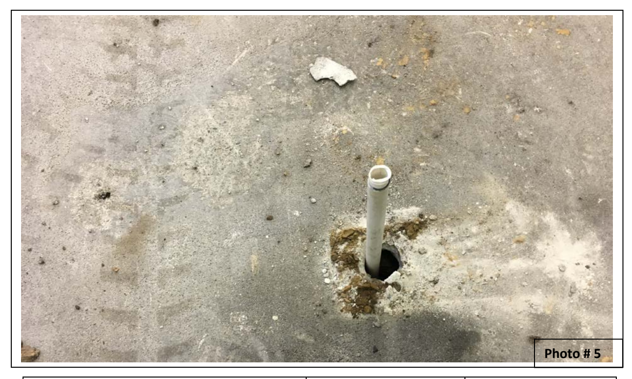
Insp. Rtp #: Date: 11/9/2017 Description: SB-12 location

DEPARTMENT OF ENVIRONMENTAL HEALTH LOCAL OVERSIGHT PROGRAM (LOP) For Hazardous Materials Releases 1131 HARBOR BAY PARKWAY, SUITE 250 ALAMEDA, CA 94502 (510) 567-6700 FAX (510) 337-9335