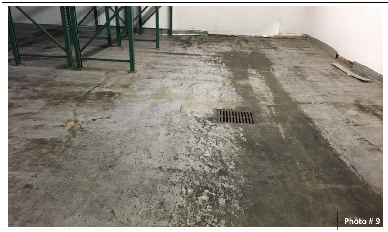
Insp. Rtp #: Date: 11/9/2017 Description: Floor drains located inside the building.

DEPARTMENT OF ENVIRONMENTAL HEALTH LOCAL OVERSIGHT PROGRAM (LOP) For Hazardous Materials Releases 1131 HARBOR BAY PARKWAY, SUITE 250 ALAMEDA, CA 94502 (510) 567-6700 FAX (510) 337-9335