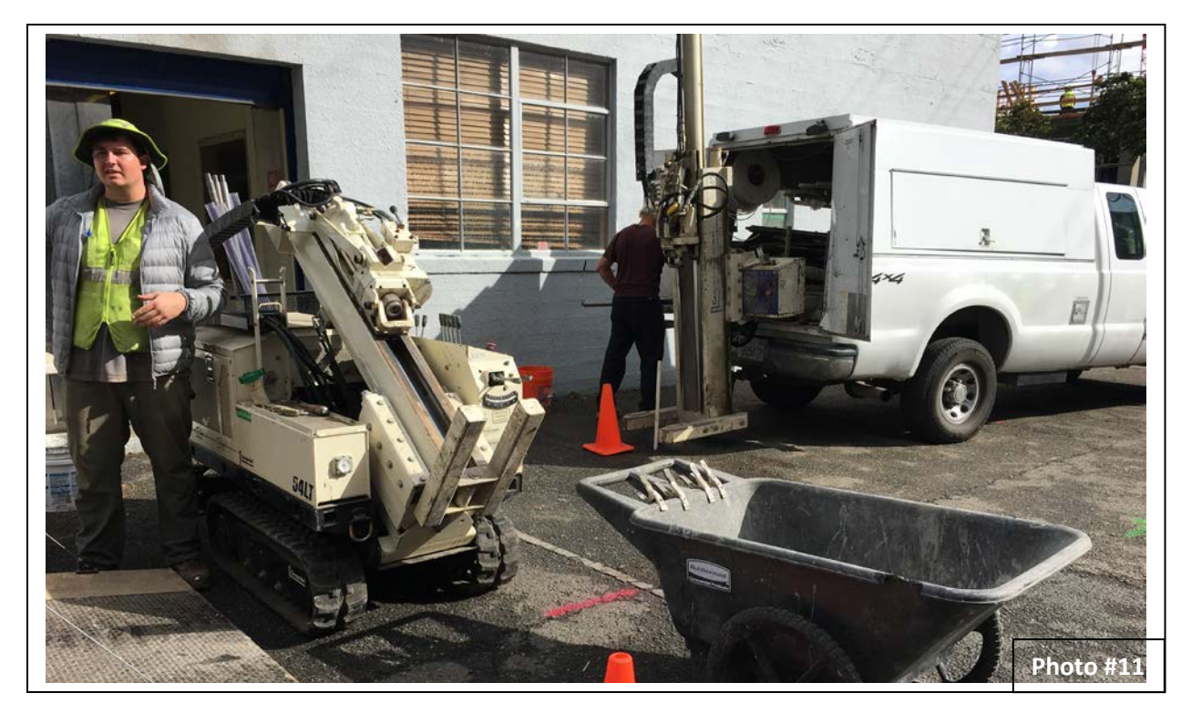
Insp. Rtp #: Date: 11/9/2017 Description: Boring location, where elevated TPH-mo was previously detected

DEPARTMENT OF ENVIRONMENTAL HEALTH LOCAL OVERSIGHT PROGRAM (LOP) For Hazardous Materials Releases 1131 HARBOR BAY PARKWAY, SUITE 250 ALAMEDA, CA 94502 (510) 567-6700 FAX (510) 337-9335