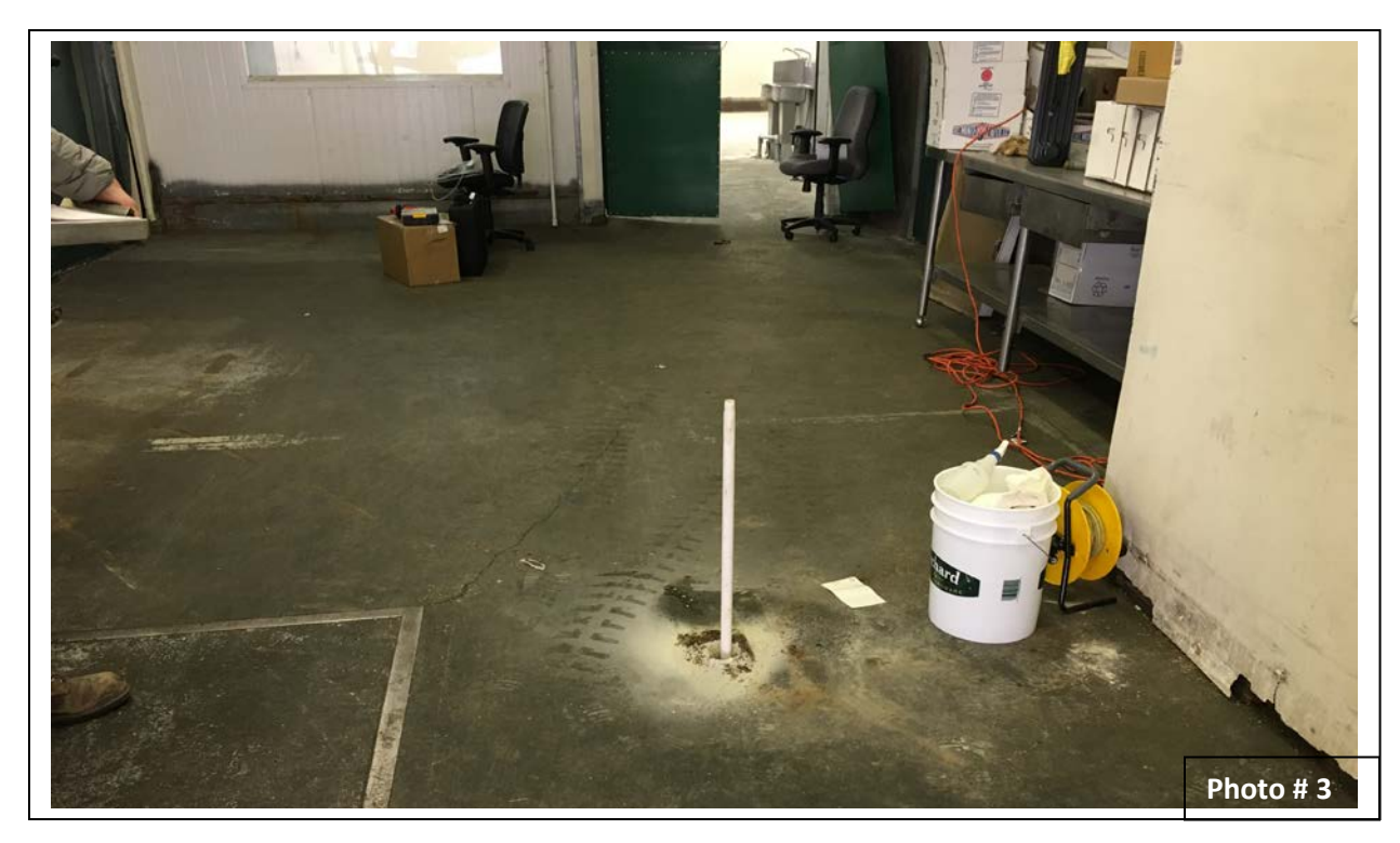
Insp. Rtp #: Date: 11/9/2017 Description: Location of SB-11

DEPARTMENT OF ENVIRONMENTAL HEALTH LOCAL OVERSIGHT PROGRAM (LOP) For Hazardous Materials Releases 1131 HARBOR BAY PARKWAY, SUITE 250 ALAMEDA, CA 94502 (510) 567-6700 FAX (510) 337-9335