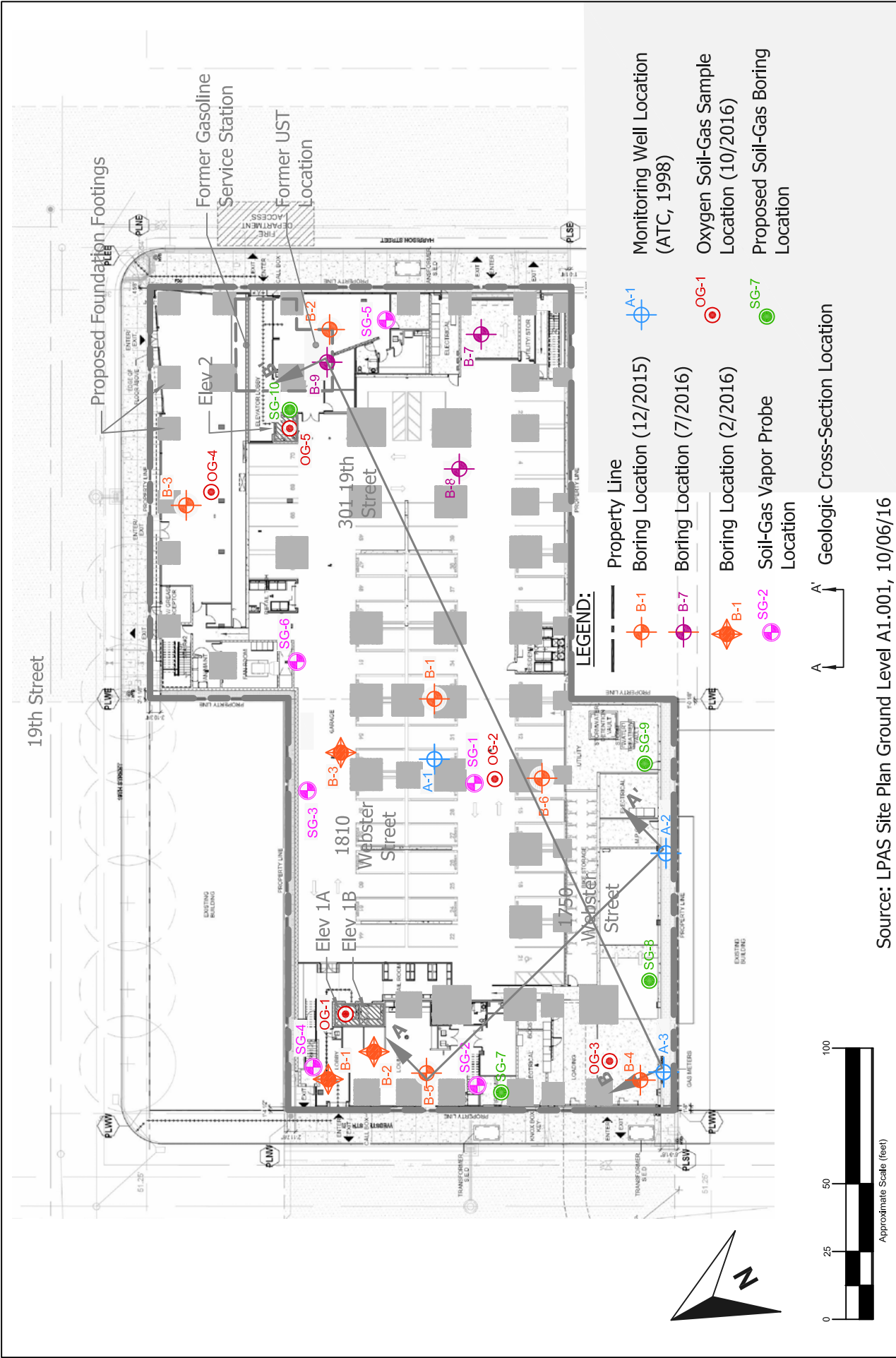
Source: LPAS Site Plan Ground Level A1.001, 10/06/16