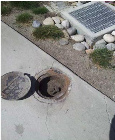
1716 Webster Street, Alameda MW-1; June 6, 2014

The photographs taken on by Broadbent & Associates on June 6, 2014 (see below - copied from ACEH Directive Letter) show the surface completion of wells MW-1 and RW-1.