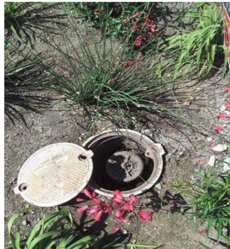
1716 Webster Street, Alameda RW-1; June 6, 2014