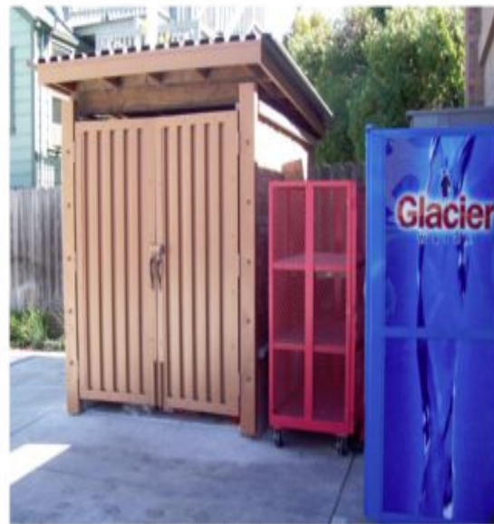
Groundwater Monitoring Well MW-3 (probably below the solid waste storage area)

Groundwater Monitoring Well designated MW-3 (its location shown above and on the Site Plan) was damaged and covered by concrete. Based on maps, photographs taken, and site measurements, MW-3 was located below the solid waste storage shown on the above photograph.