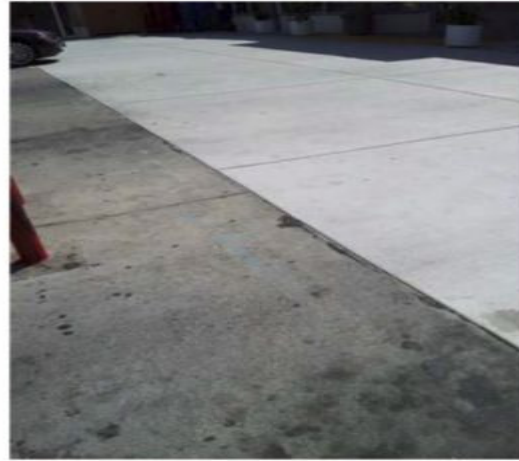
1716 Webster Street, Alameda MW-2; June 6, 2014