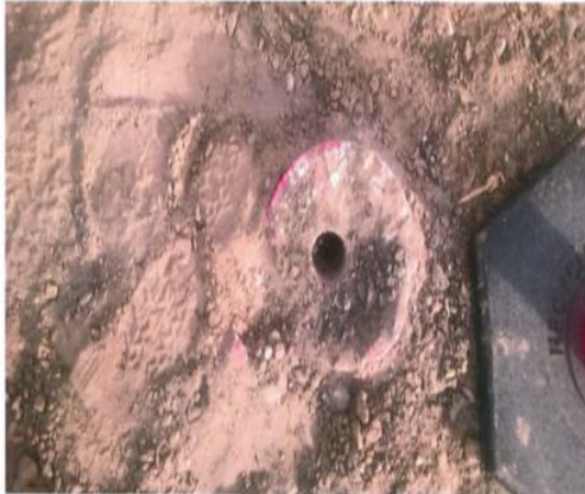
Damaged Monitoring Well MW-2

The other photographs taken by Broadbent & Associates on June 6, 2014 (see below - copied from ACEH Directive Letter) and on October 2, 2014 show wells MW-2 and MW-3 were damaged during grading and construction activities and covered by concrete.