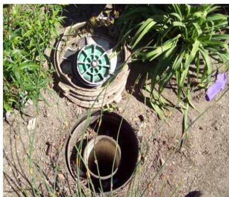
RW-1 - October 2, 2014

RW-1 " Christy Box " was damaged and needs to be replaced.