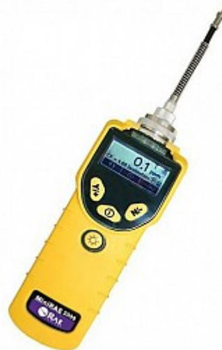
Figure 1: Special instrument to check for VOCs in household cleaning products prior to indoor air sample collection.

Items removed from the business facility should be safely stored until the indoor air sampling is completed. You can store these outside or in a large container (less preferred method).