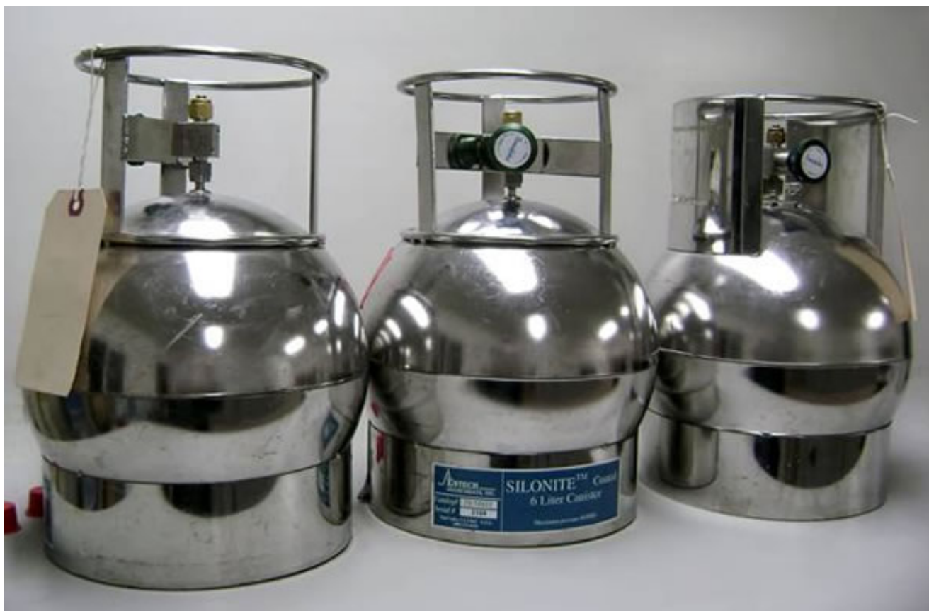
Figure 2: Example of Summa Canister

The goal of the indoor air sampling is to measure the concentration of VOCs in your facility under normal conditions. Therefore, during sampling, you should continue with your regular business routine. However, it is important that you do not use your central heating or air conditioning during the sampling. We understand that the doors to your facility will be opening and closing as customers enter the facility but we recommend that the doors remain shut, unless customers are coming or going. Also we discourage any smoking or burning of candles during the sampling.