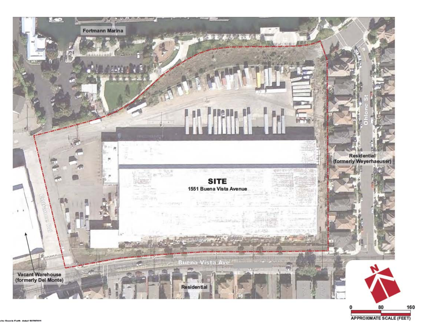
Figure 1: Aerial View of Property