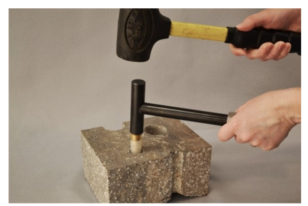
Figure 2. Installing the Vapor Pin<sup>™</sup>.

the extraction/installation tool is aligned parallel to the Vapor Pin^{TM} to avoid damaging the barb fitting.