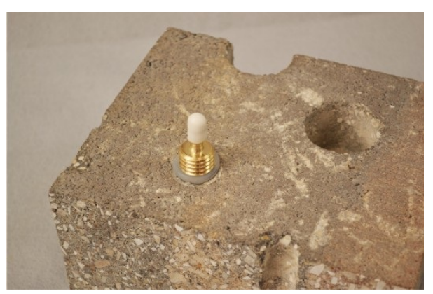
Figure 4. Installed Vapor Pin<sup>™</sup>.

During installation, the silicone sleeve will form a slight bulge between the slab and the Vapor Pin<sup>™</sup> shoulder. Place the protective cap on Vapor Pin<sup>™</sup> to prevent vapor loss prior to sampling (Figure 4).