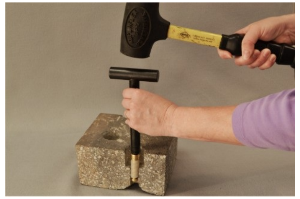
Figure 3. Flush-mount installation.

For flush mount installations, unscrew the threaded coupling from the installation/extraction handle and use the hole in the end of the tool to assist with the installation (Figure 3).