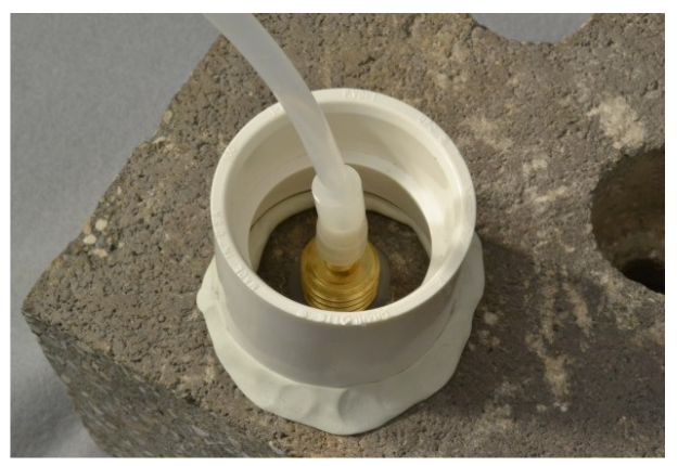
Figure 6. Water dam used for leak detection.

10) Conduct leak tests in accordance with applicable guidance. If the method of leak testing is not specified, an attractive alternative can be the use of a water dam and vacuum pump, as described in SOP Leak Testing the Vapor Pin<sup>™</sup> via Mechanical Means (Figure 6).