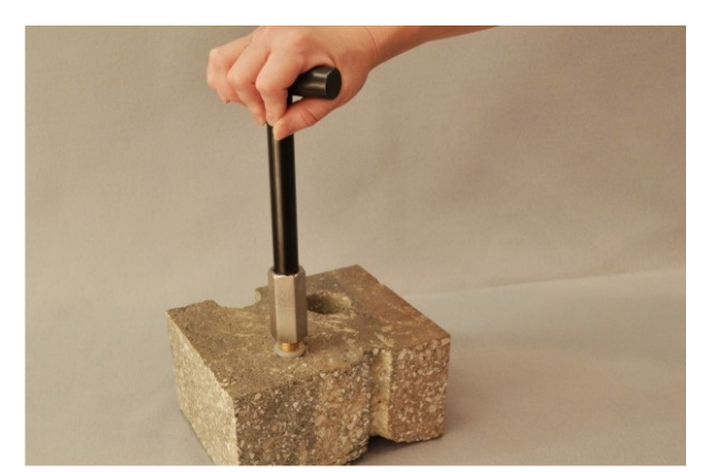
Figure 7. Removing the Vapor Pin<sup>™</sup>.

tight seal, but it could also be a source of VOCs during subsequent sampling.