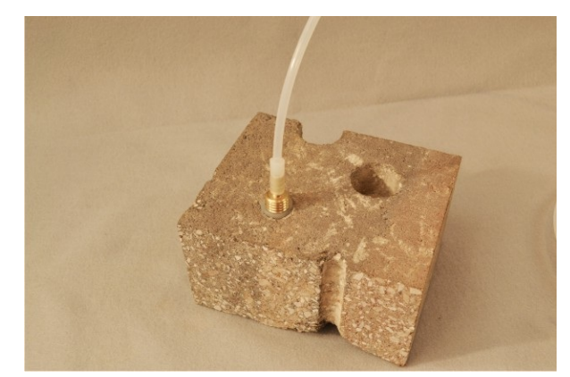
Figure 5. Vapor Pin<sup>™</sup> sample connection.