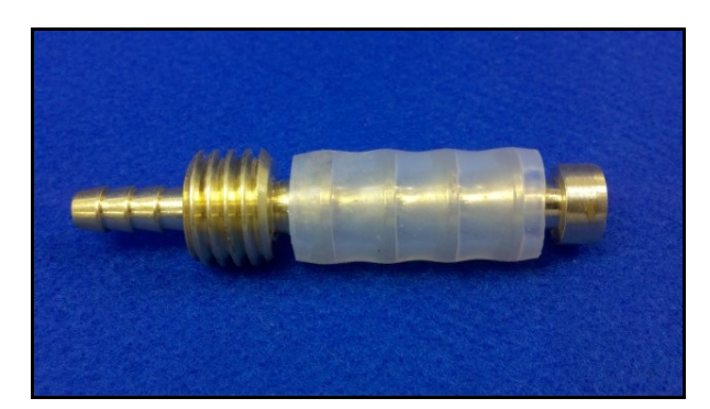
Figure 1. Assembled Vapor Pin<sup>TM</sup>.