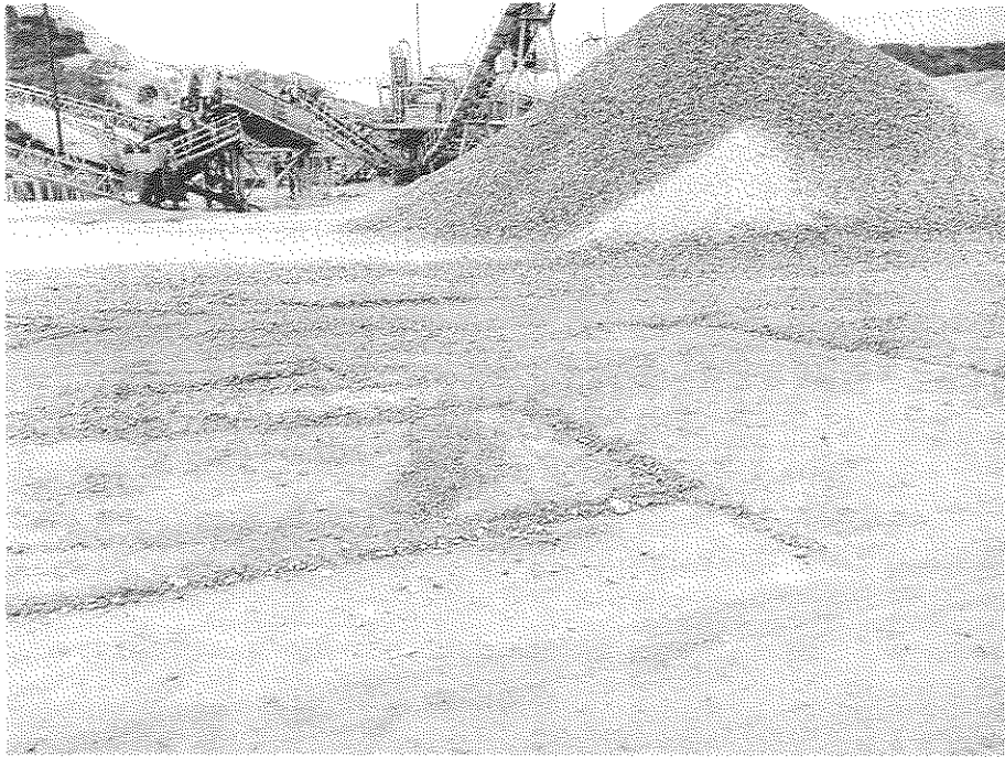
Scrape-cleaned spill location.