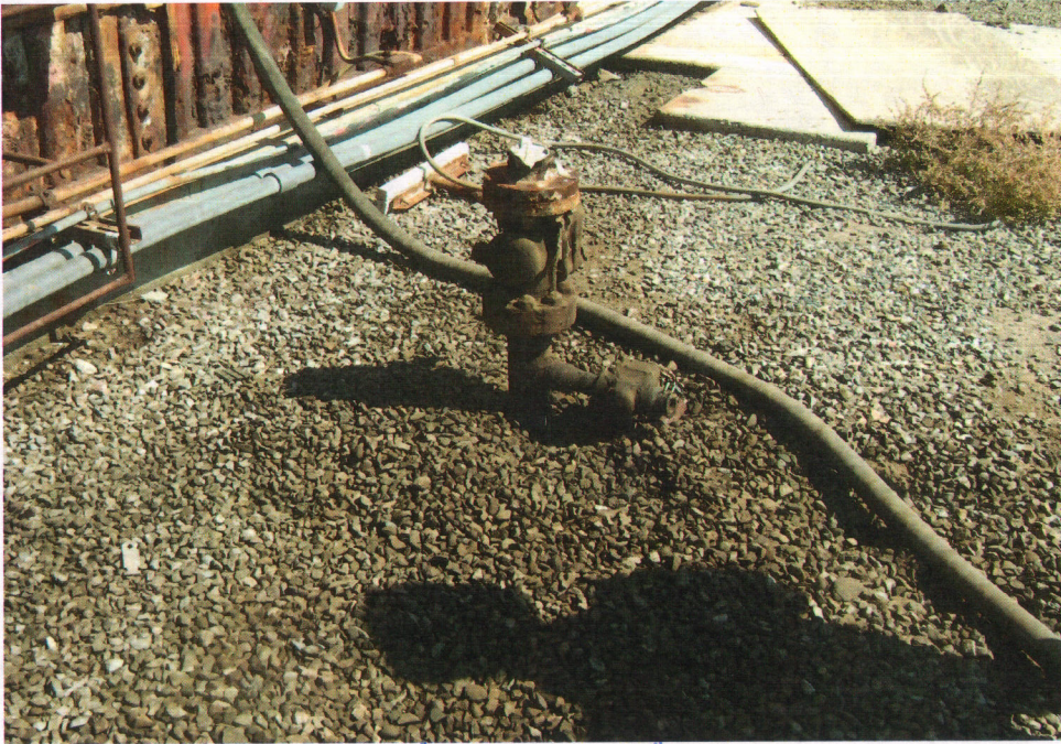
Natural Gas Valve