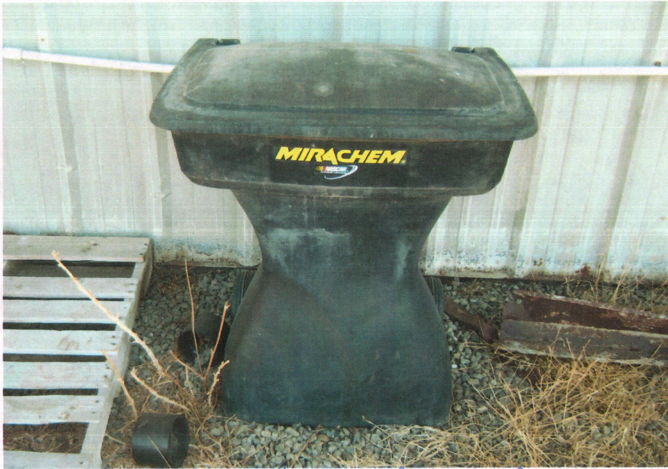
former cleaning solvent - empty