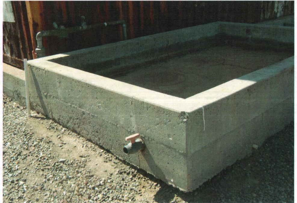
former containment systems