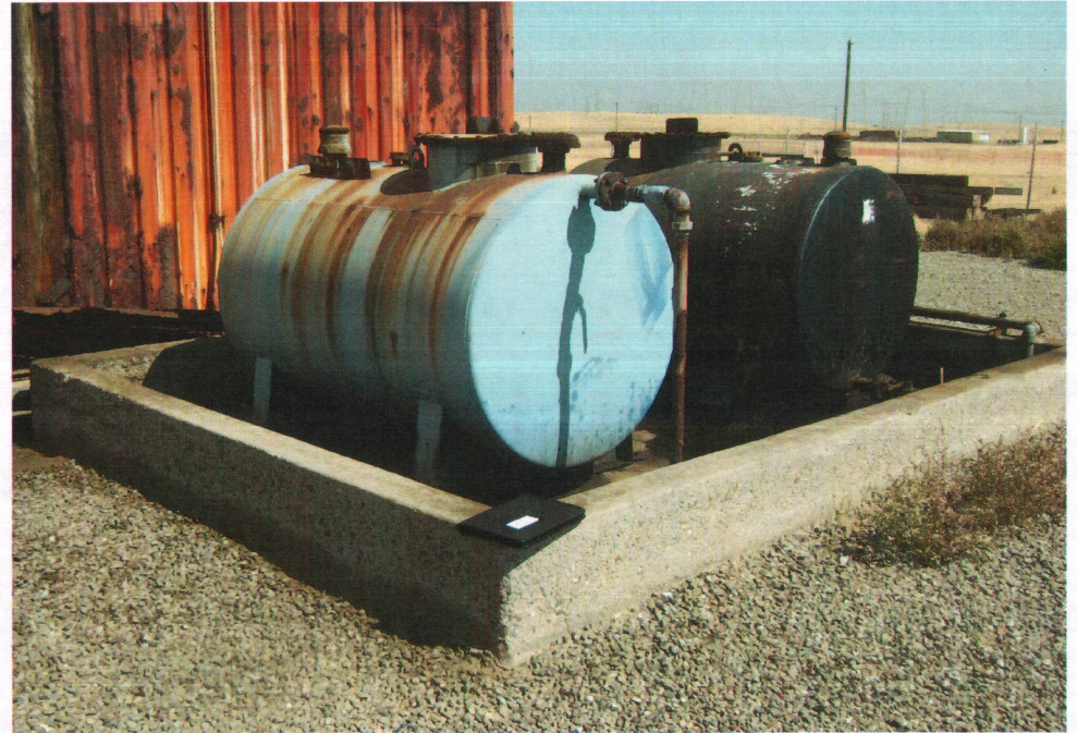
Used O:1 AGT