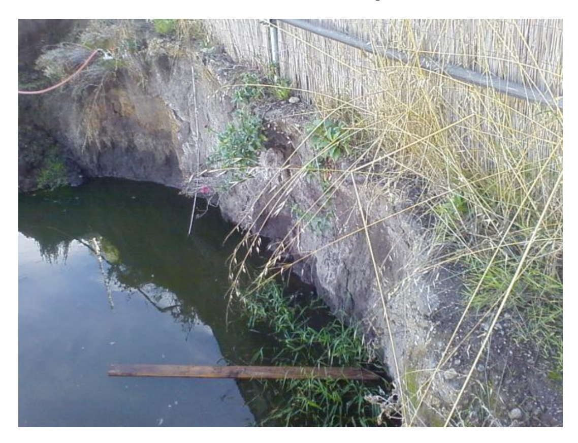
Plate 2. View of excavation sidewall where sample EX-3-S-W was collected