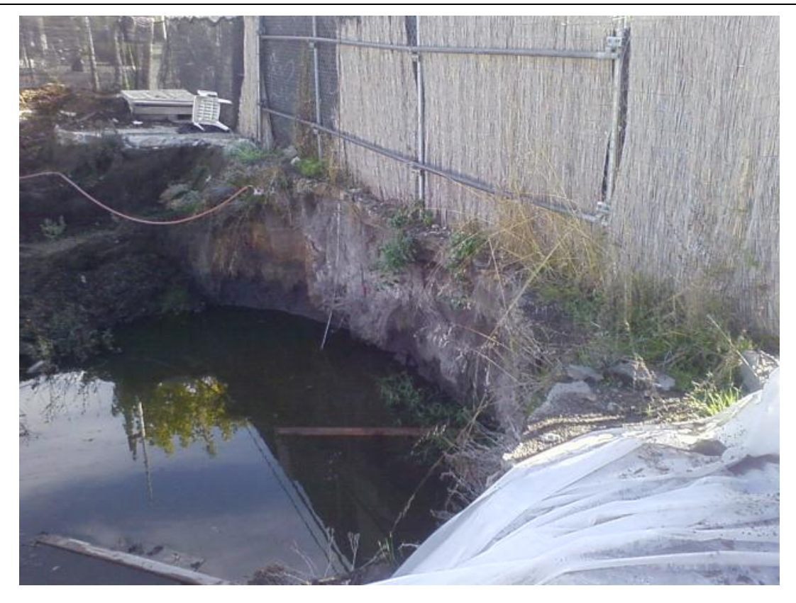
Plate 1. View of excavation sidewall where sample EX-3-S-W was collected