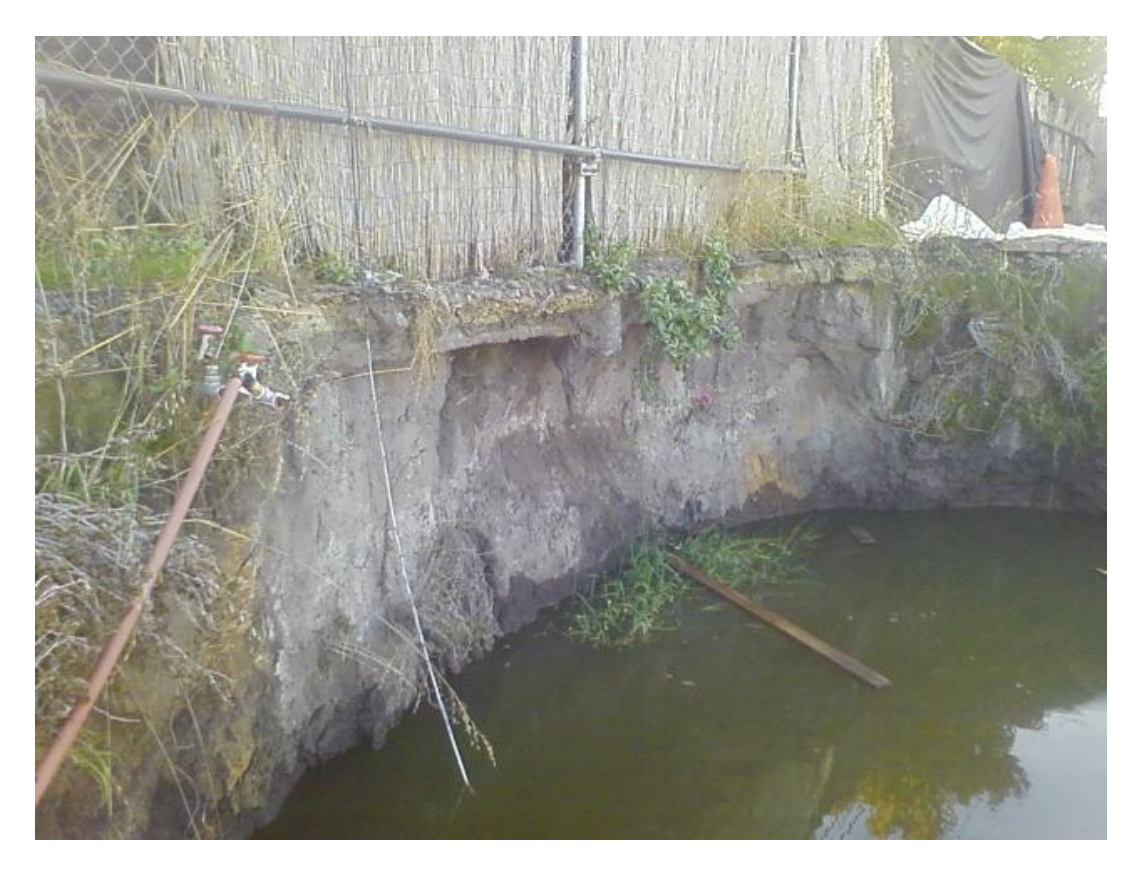
Plate 4. View of excavation sidewall where sample EX-3-S-W was collected