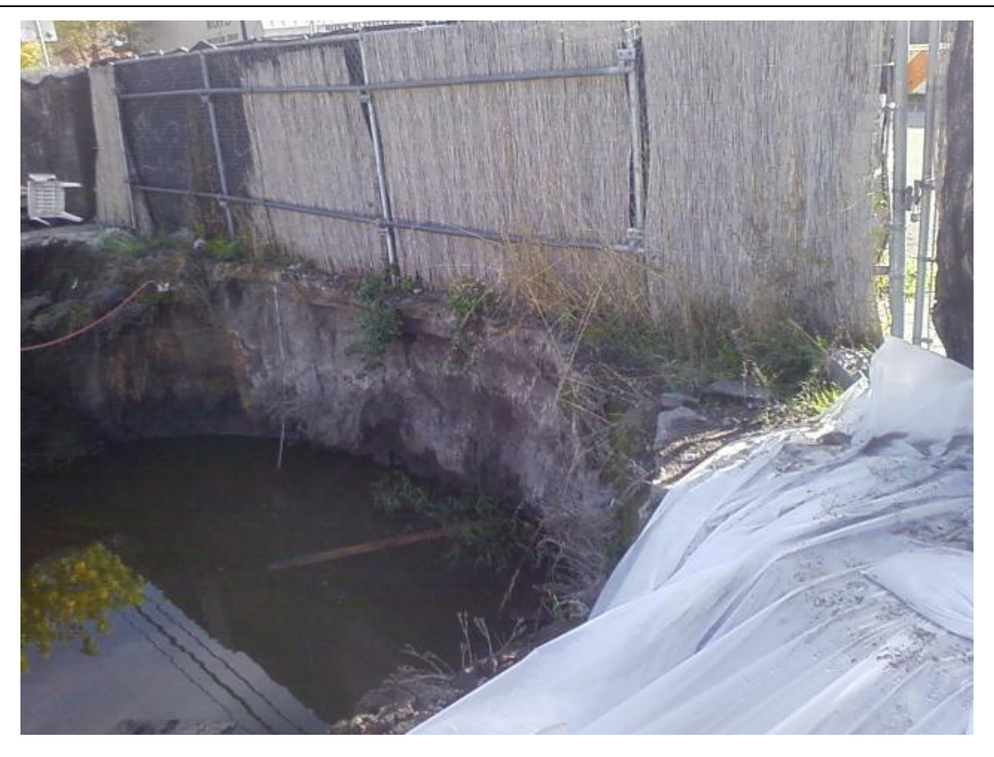
Plate 3. View of excavation sidewall where sample EX-3-S-W was collected