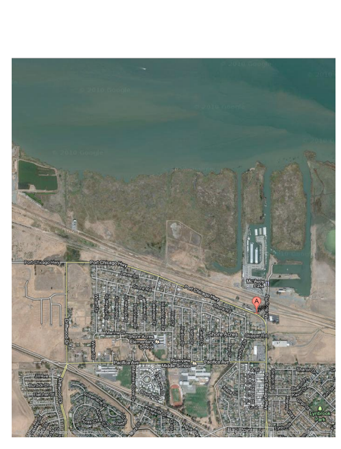
825 Port Chicago Hwy Bay Point, CA 94565

According to SOMA Environmental Engineers, all the contaminated soil was supposed to be hauled DIRECTLY to a Class 2 Landfill - No stops are to be made without authorization and proper documentation in the Soil Manifest.