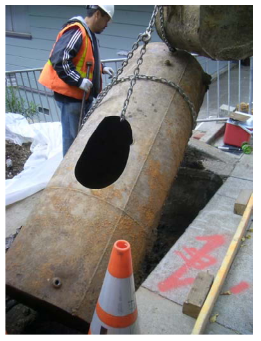
TANK READY TO BE REMOVED FROM EXCAVATION