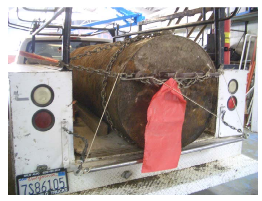
TANK READY TO BE TRANSPORTED FOR DISPOSAL